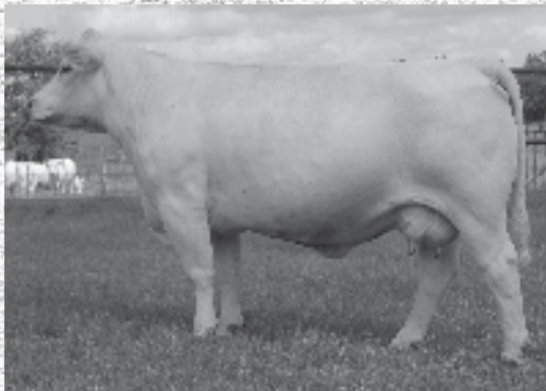
M6 MS DUKE 645 PLD ET EF1065979