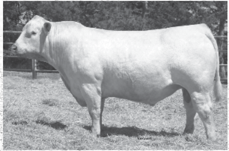
HCR Answer 2042

Outstanding young heifer with excellent EPD's.