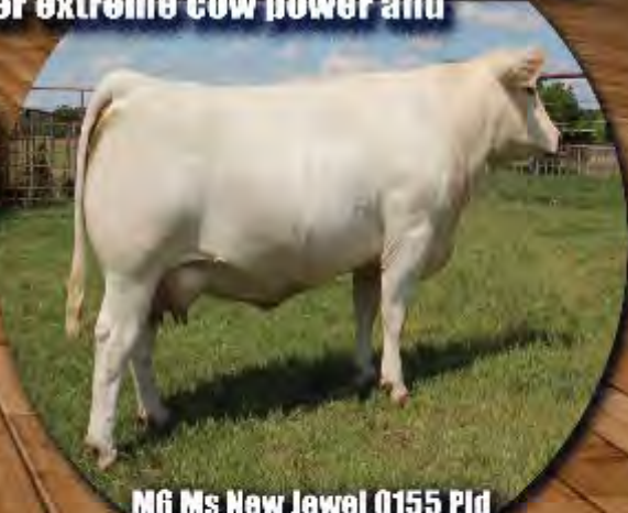
M6 Ms New Jewel 0155 Pld

Jeffries Charolais Reinhart Charolais Testerman Charolais