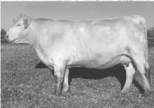
LT ATHENA'S TREASURE 6188 P F1046998