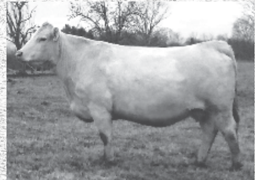
C5 MS WIND 601 PLD ET EF1060167