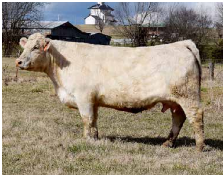
REAVES MS ICON ANNIE 2211 SELLS AS DONOR DAM OF LOT 25

Est. EPDs. This will be an EPD leading animal with this dynamic blend of two powerful individuals! Awesome opportunity without the heavy investment of owning the two exceptional parents.