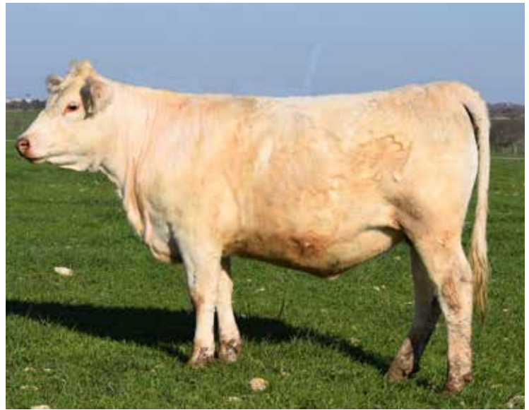
MS PC CRAZY CORA 1821 DAM OF LOT 42

Safe in calf 7 months to Reaves Germaine Hova 2281, a JMAR Hosea son out of M6 Cool Germaine 1145. Cora descends from the great Lehmanns Donor cow, 745, they purchased in the Sale of Excellence for $17,500 and now have 40 progenies from her registered with AICA. With Tank she also excels with EPDs ranking in the top 8% CE, 35% WW, 10% YW, 2% Milk, 3% MTL, 7% CW, 35% Marb, and 3% TSI, (293.84).