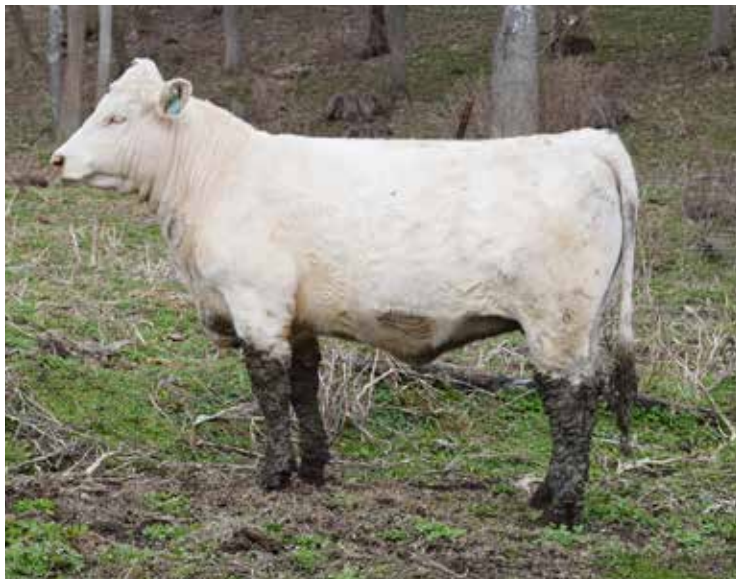
WELCOME GROVE 2401 SELLS AS LOT 45