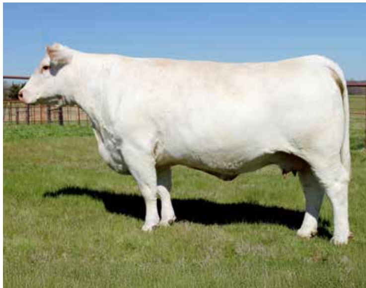
M6 MS NEW NANCY 274 P ET GRANDDAM OF LOT 34