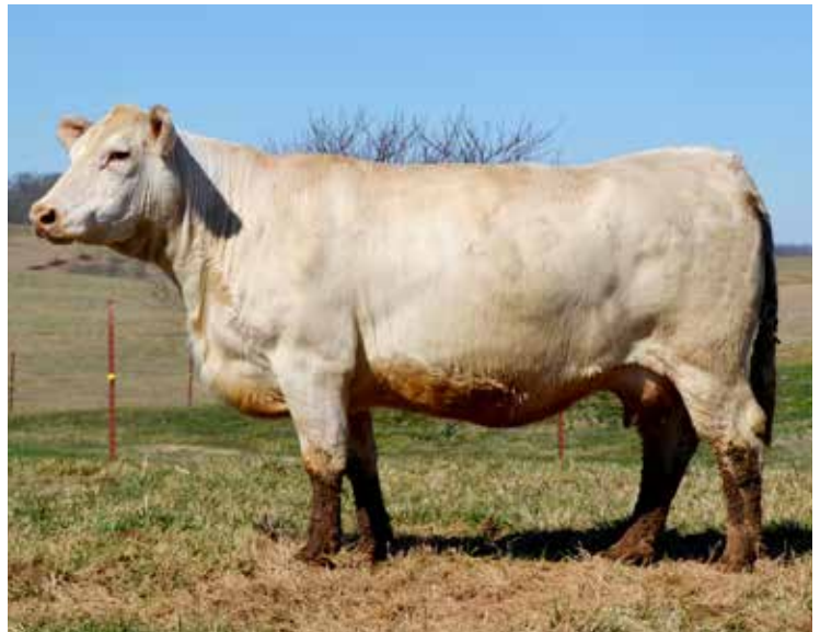
REAVES MS GERMAINE PATRIOT 815 DAM OF LOT 51