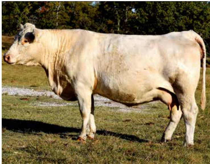
FINK PERFECTION 9315 3822 GS DONOR DAM OF LOT 62