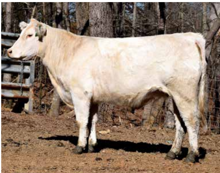
RCR MS TANK'S ILLUSION K902 SELLS AS LOT 14

Bred A-I on 12/2/24 to WCR Master Chief 037 P; PE from 1/1/25 to sale to Reaves Patriot 2271, M989968. An EPD powerhouse, ranking in top 6% CE, 15% BW, 25% WW, 15% YW, 5% Milk and MTL, 3% CW, 20% REA, 30% Marb, & 1% TSI! Her phenotype also draws praise with her extension and frame. Her long side and depth add abundantly to her value. The masterful blend with Master Chief will only enhance the EPDs in their offspring, he ranks in top 3% for CW, REA, and TSI.