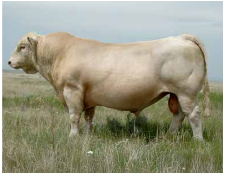
LT BLUE VALUE 7903 ET DONOR SIRE OF LOT 44

Selling 3-Embryos from mating of LT Blue Value 7903 ET x Fink Perfection 7758 429 GS. Blue Value and 7758 are both PAF. Another set of great numbers to work with and some of the most popular genetics in the breed today! Daughters from this mating would be awesome and the bulls a cowmans dream!