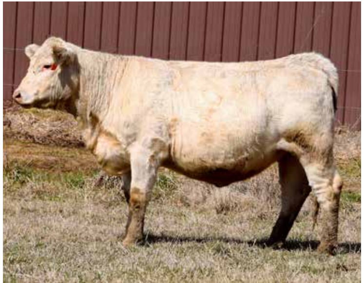
REAVES MS HONDO 2306 SELLS AS LOT 33

Safe in calf 7 months and due around sale time to Reaves Germaine Hova 2281, a HOP, (homozygous Polled), and PAF sire! Ms Hondo is a maternal sib to Lot 10 bull that is selling. Hondo is a featured sire in the Fink and Larson breeding programs. EPDs rank in the top 20% WW, 4% YW, 15% Milk, 9% MTL, 3% CW, 10% REA, 5% Marb, and 2% TSI for Ms Hondo. This moderate frame coming first calf heifer descends from royalty at Finks, line-bred Gold Standard, Free Lunch, & Flash.