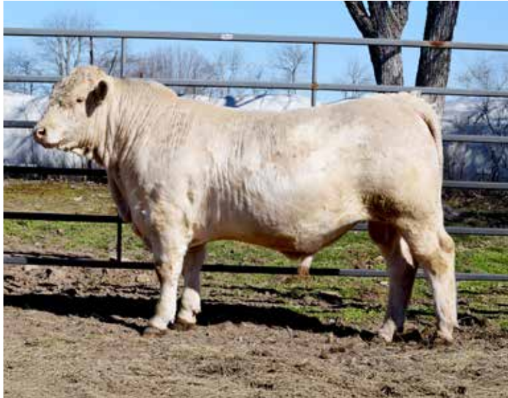
BGC JUBAL 2302 SELLS AS LOT 1

This legendary cow can have volumes written about her and her progenies. One of the all-time most influential cows in the Charolais breed. She was the first cow family listed in the M6 Dispersal sale. His footnote on the dispersal was "the Germaine Family is built to last". She topped the 2016 M6 sale with her daughter at $15,250.00. But her offspring like M6 Ms New Germaine 484 sold for $36,000, and her heifer calf for $9,000.00. A full brother sold for $30,000. Another heifer, 579, $19,000, to just mention a few in the dispersal sale. The offspring of 1145 in the Dispersal sale totaled up $167,500.00. And since then, many more of her sons and daughters have topped sales or at the very top, including the 2023 Southern Connection, a bull sold for $7,500.00, 2021 Appalachian, a son for $6300.00 to top the bull sale. In the 2022 Appalachian, a daughter, 585, produced the top seller, an open heifer at $5,000. This cow family is one of the most prolific in production and profit! A fantastic opportunity now with lots 1-8 of maternal sibs out of 1145 and different breed leading sires! What an unbelievable opportunity to invest in a well thought-out and proven program to lead your herd into the next phase of more profit and proven program!