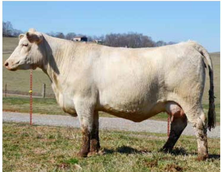
REAVES MS GERMAINE LAW 2110 DONOR DAM OF LOT 43

Selling 3-Embryos from mating of FTJ Silver Bullet 2258 x Reaves Ms Germaine Law 2110. Est. EPDs. Silver Bullet is HOP and PAF and 2110 is also PAF. Outstanding EPDs will put you on top of many competitors with these rankings! Super Pedigree, Abundant Quality!