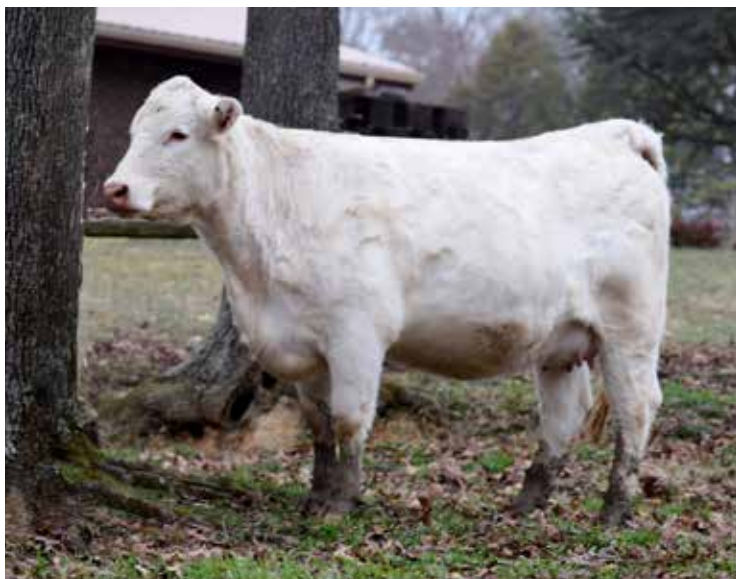
FRED WATERGIRL 32 SELLS AS LOT 47

Selling Open. Paternal sib to Lot 45 and resembles peas in a pod, tremendous uniformity, correctness and loaded with style.