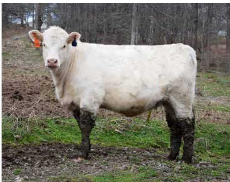
WELCOME GROVE 2405 SELLS AS LOT 46

Selling Open. Beautiful designed heifer, straight lined, long sided, extremely feminine with excellent bone.