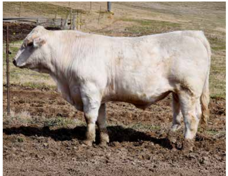
MILHORN'S MONEY MAKER 2336 SELLS AS LOT 4

Sells Fertility and Trich Tested. Selling Full Interest and Full Possession This high-end bull is a duplicate of his sire, WCR Gambler 1167, that was a top seller in a Wienk Sale. Gambler is a calving ease sire with strong milking daughters. Top 15% Milk and 20% MTL on 2336! Dam is a super producer with Cl of 12/21; 12/22; and 12/23 and a very solid Grid Maker and Cigar mating.