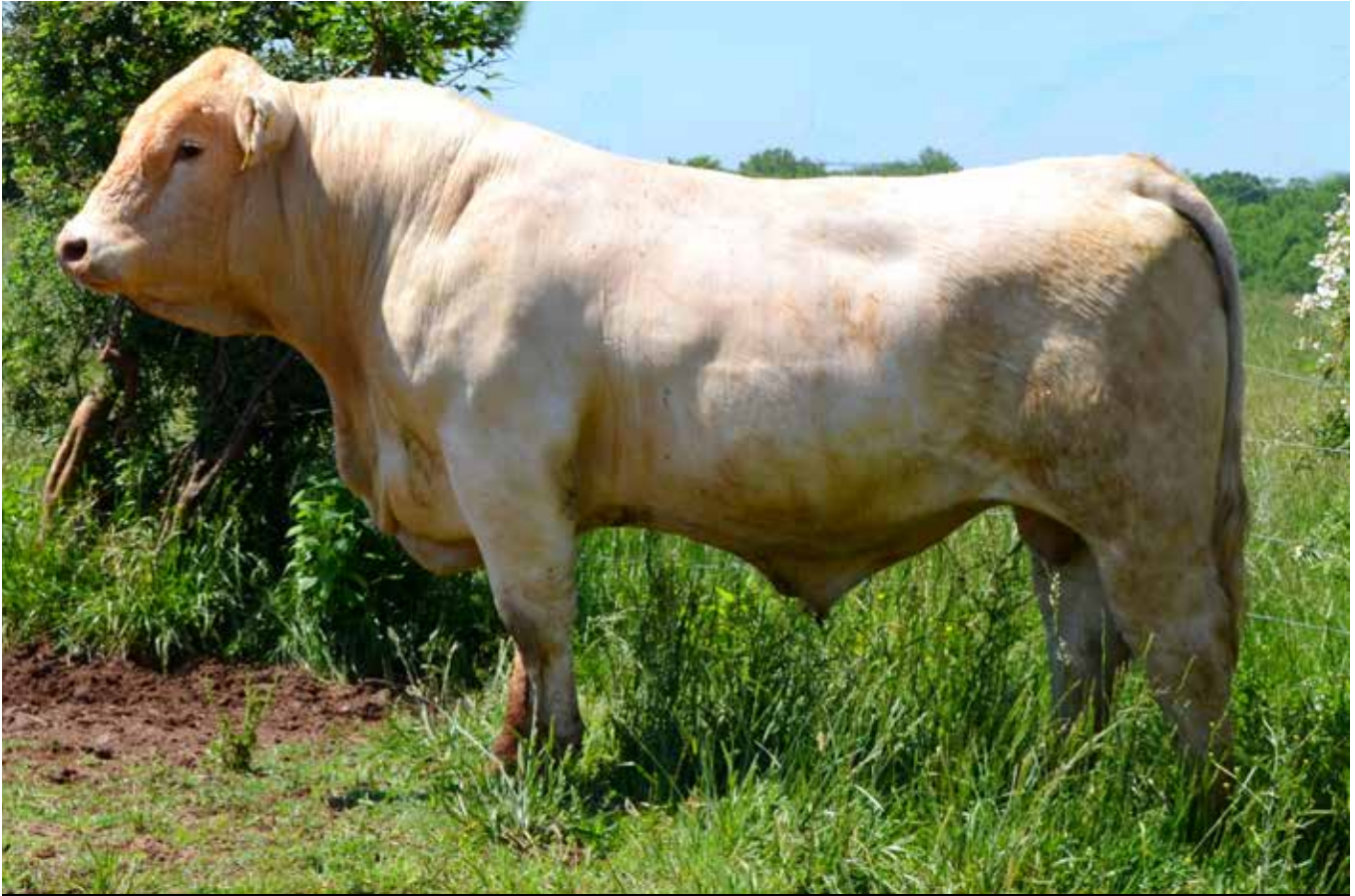
DC/CRJ ATOMIC MASS J3003 P – SIRE OF LOTS 55-59