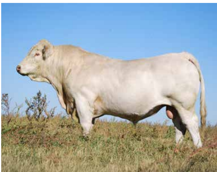
CJC MR PRESIDENT T122 SIRE OF LOT 19

Bred A-I on 2/25/25 to M6 Bells and Whistle 258 P. Donor Dam is a full sib to Three Trees Wind 0383 being out of Wind and 8121. 8121 has 46 calves registered with AICA and Fancy Has 8 progenies. A maternal sib to Lot 19, both incorporating DeBruycker genetics on the top side. Fancy ranks in top 35% WW, 10% YW, 20% Milk, and 20% MTL, 3% CW, 25% REA, 30% Marb, and 2% TSI, very impressive EPDs.