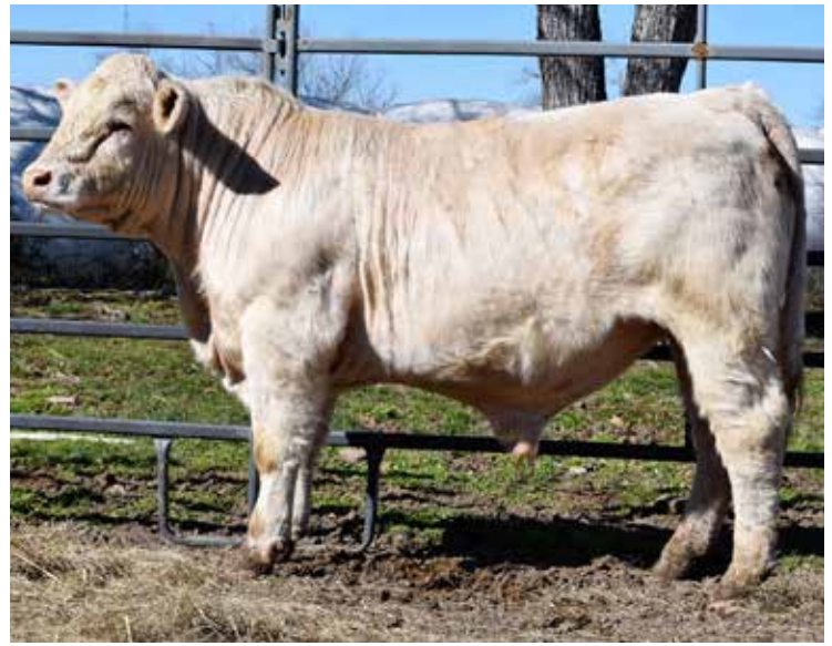
B&B REDEMPTION 2308 ET SELLS AS LOT 2

Sells Fertility and Trich Tested. Selling Full Interest and Full Possession A cowmans dream, this power-packed, thick butted bull is loaded with muscle and depth. Proven pedigree of winning with his dam being a full sib to several National Champions. His granddam, 0641, has 332 progenies registered with AICA.