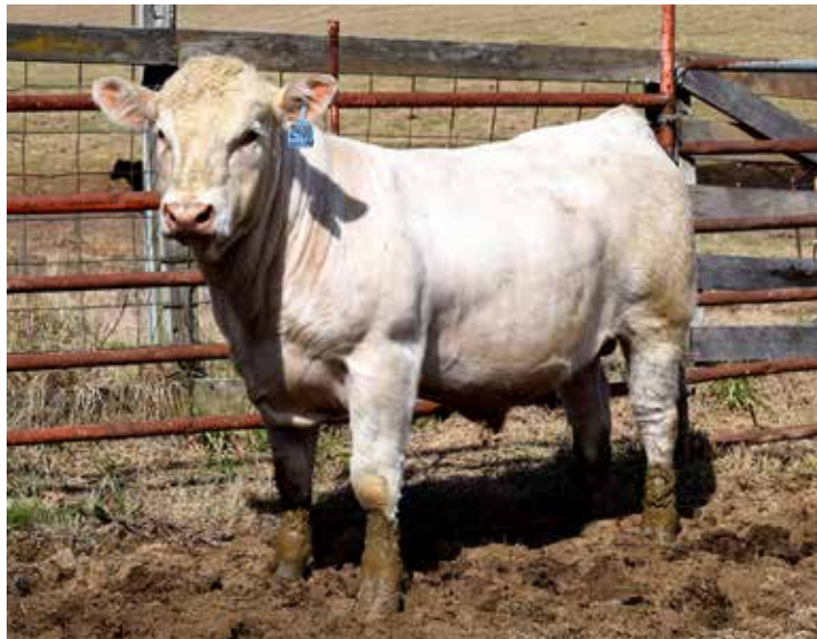
MILHORN'S SOUTHERN AFFINITY 00 SELLS AS LOT 5