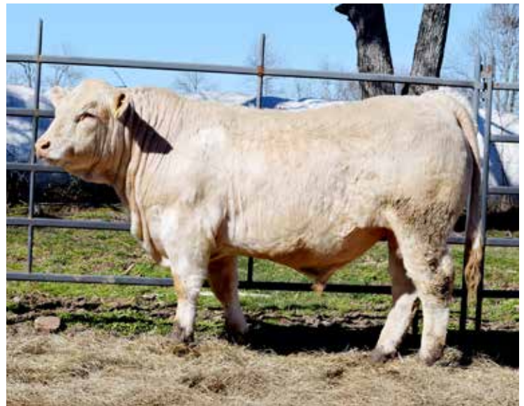
B&B LEDGER 2387 ET SELLS AS LOT 3

Sells Fertility and Trich Tested. Selling Full Interest and Full Possession Another solid, thick, deep-bodied, easy-fleshing bull that will produce calves that are scale mashers! His dam is a superb Smokester cow with a great record, 13 calves registered with AICA. A full sister is in The Stabel herd, KS. Buying proven genetics keeps your herd moving forward with less problems!