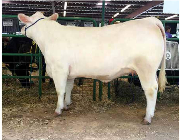
MR MS IMPRESSIVE 405 DAM OF LOT 50

Sells safe in calf to Reaves Mr Value Added 2255. The dam has a superior pedigree of show winning genetics with Carbon Copy and the proven power genetics of Cigar and OHF She Smoking D823 ET. D823 has produced many of the high selling lots in the Appalachian Sale and the Southern Connection Sale. Del Rio also backed by super genetics in Rio Bravo and the donor 717.