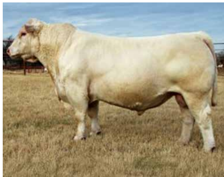
M6 SLAM DUNK 3115 P ET DAMSIRE OF LOT 7

Sells Fertility and Trich Tested. Selling Full Interest and Full Possession Tank has been one of the top sires in the breed and progeny have topped many sales! Another very solid proven pedigree. MR 15! He ranks in top 15% for CE, BW, Milk, and TSI for EPD comparisons. Dam traces to a very stout Slam Dunk cow! Built on a very solid pedigree foundation, you will get great results with a sire like this working in your herd!