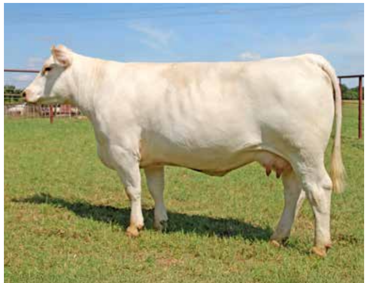
M6 MS NEW NANCY 277 P ET DAM OF LOT 37

Bred A-I on 10/16/24 to LT Blue Value 7903 ET, safe in calf. Cawley Cattle Co. GA., now owns WCR Gambler 1167 P, a DC/CRJ Tank E108 P son bred by Wienk Charolais. Her EPDs rank her in the top 4% Milk, 15% MTL, and 40% for TSI, at 271.69. The Blue Value calf will probably make this a free cow as it will return a great profit if sold.