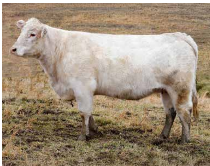
REAVES MS BENAIAH 2205 SELLS AS LOT 30