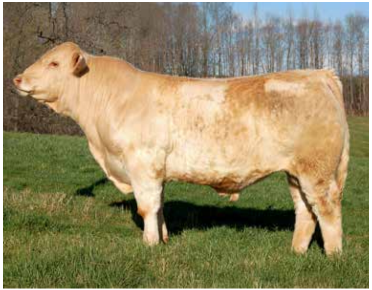
JMAR JUBAL 5P01 SIRE OF LOT 32

Due before sale to Reaves Germaine Hova 2281, EM985582. A JMAR Hosea 2M70 son out of M6 Cool Germaine 1145. Maternal sib to Lot 31, another great brood cow to develop and bred to the exciting new Hosea son. Started with a 65 lbs BW and grew rapidly to wean at 698 lbs giving credit to her sire and dam! Full Throttle was also a maternal sib to Reaves former AICA Trait Leader, M6 Led Weight 609.