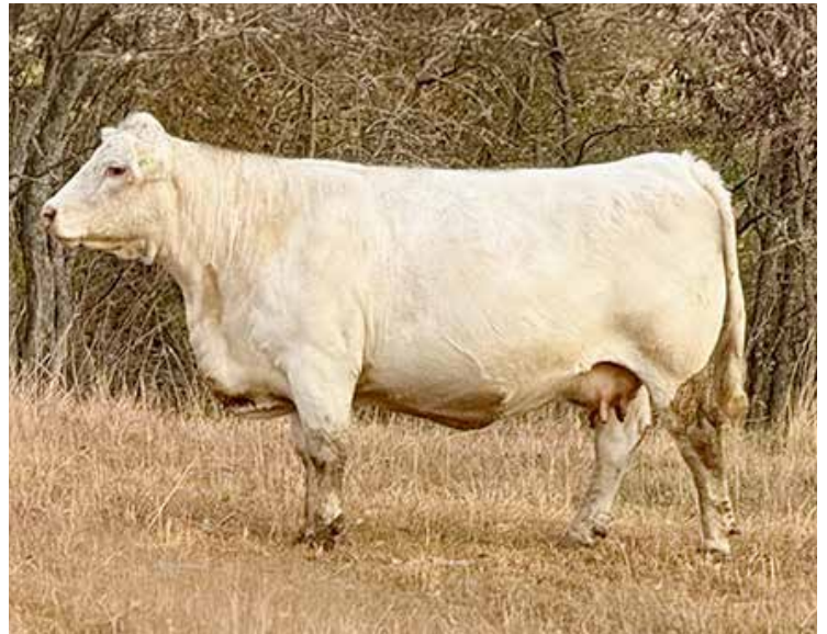
LCC MISS LADY 0308 653 BF DONOR DAM OF LOT 60B

Selling Choice of 3-Embryo from mating of WC Encompass x LCC Miss Lady 0308 653 BF We will only sell 1-choice of these two matings. (61A or 61B). Lady 038 ranks in top 8% WW, 2% YW, 6% CW, 25% REA, 4% Marb, and 3% TSI for Breed. Lady is a full sister to Hondo, featured sire at Finks and sired the high selling sire group in 2024 Bull Sale. This should be an awesome opportunity for any breeder!