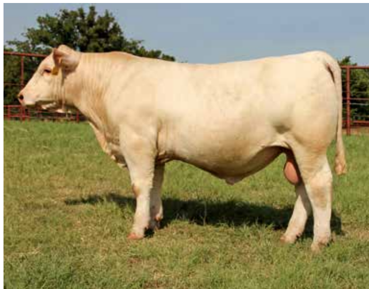
M6 LAW & ORDER 577 P SIRE OF LOT 31