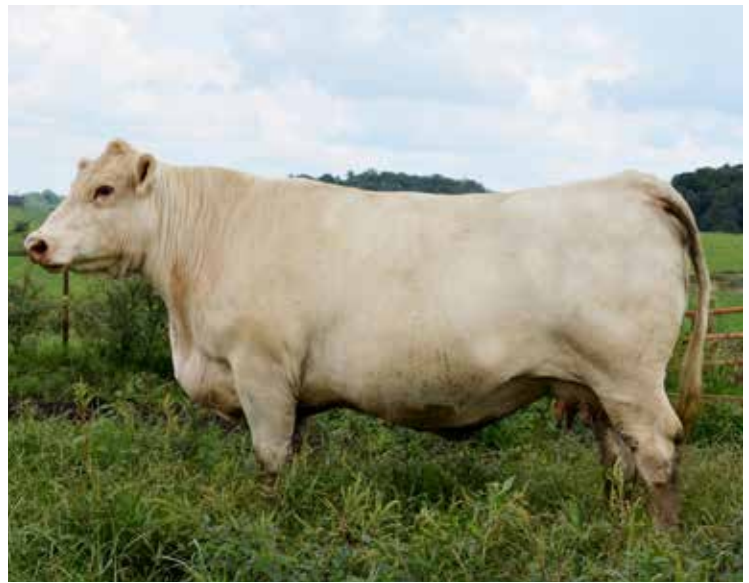
M6 NEW GERMAINE 585 P ET SELLS AS LOT 21

Bred A-I on 2/18/25 to JMAR Joshua 23M11, EM956754, a full sib to JMAR Jefferson and JMAR Kingdom. EPDs are well balanced with a top 20% YW, 30% Milk, 25% MTL, 30% CW, 20% Marb, and 25% TSI. Jubal has also sired calves out of F136, the dam of Jefferson and Kingdom that you will hear more about with age. Real potential for a donor here or very top of the line producer!