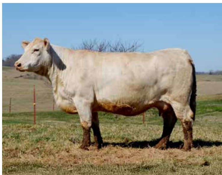
REAVES MS GERMAINE PATRIOT 815 SELLS AS DONOR DAM OF LOT 24

Due before sale to Fink 2230 of 77 467, M985497, newest herdsire at Reaves, sired by Silver Gun 467 out of a Free Lunch cow. 2120 Ranks in the top of EPDs, top 4% WW, 1% YW, 4% Milk, 1% MTL, 2% CW, 8% REA, 20% Marb, and 3% TSI. The Fink bull ranks in top 1% for WW, YW, 3% MTL, 1% CW, 1% Marb, and 1% TSI, a very Blow the Doors Open combination. Amazing volume with this deep, long-bodied feminine brood cow! Dam was a top selling cow in the 2024 Appalachian Sale to KK.