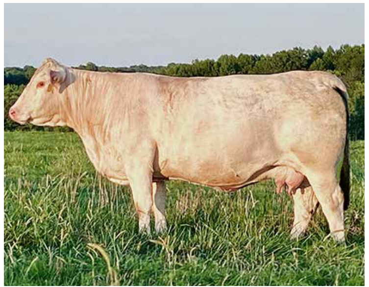
DCR MS SILVER LED F136 DONOR DAM OF LOT 60A

Selling Choice of 3-Embryos from mating of WC Encompass x DCR Ms Silver Lady F136 Est EPDs. Encompass ranks in top 1% of Breed for WW, YW, MTL, CW, REA, and TSI, top 7% Marb. Silver Lady ranks top 1% for WW, YW, CW, and TSI, and 2% REA, 6% MTL (also the dam of JMAR Jefferson). How do those numbers compare to your herd! A good time to invest in Quality Genetics!