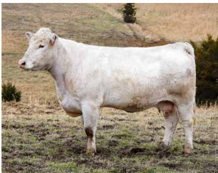
REAVES MS MASTER GERMAINE 2265

Sells Bred A-1 on 9/19/24 with sexed heifer semen from LT Countdown 9712 Pld, safe in calf. Her dam has produced 19 calves and her granddam the great 1981 has produced 30 calves showing this is a very functional and productive cow family! The Countdowns are easy calving for this first calf heifer and have tremendous EPDs. Lots of potential with this rich history of brood cows!