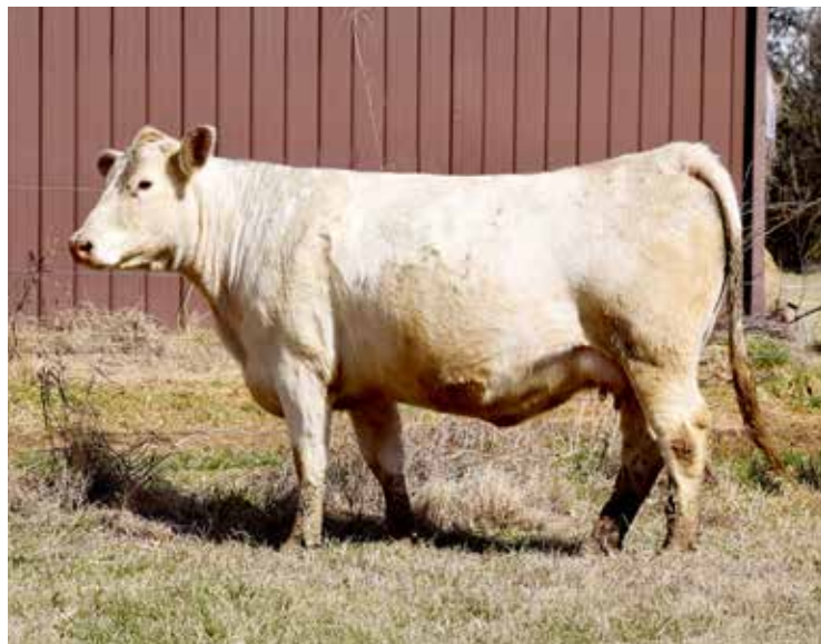
REAVES LADY ICON GERMAINE 2120 SELLS AS LOT 23