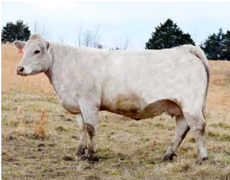
B.B. QUEEN LINDA 2100 SELLS AS LOT 36

Open Heifer, will be 11 months old at sale time. Everyone is loving their Blue Value daughters and he is becoming one of the most sought after brood cow sires. She ranks in the top 30% WW, 15% YW, 20% Milk, and 15% for MTL, CW, REA, Marb, and 6% TSI for EPDs. She descends from Lehmann's great 745 donor cow that was 2nd high selling cow in a Sale of Excellence sale $17,500.