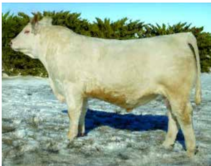
LT PATRIOT 4004 PLD GRANDSIRE OF LOT 54