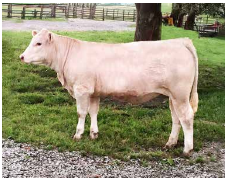
CS MS SMOKESTER D119 DAM OF LOT 58