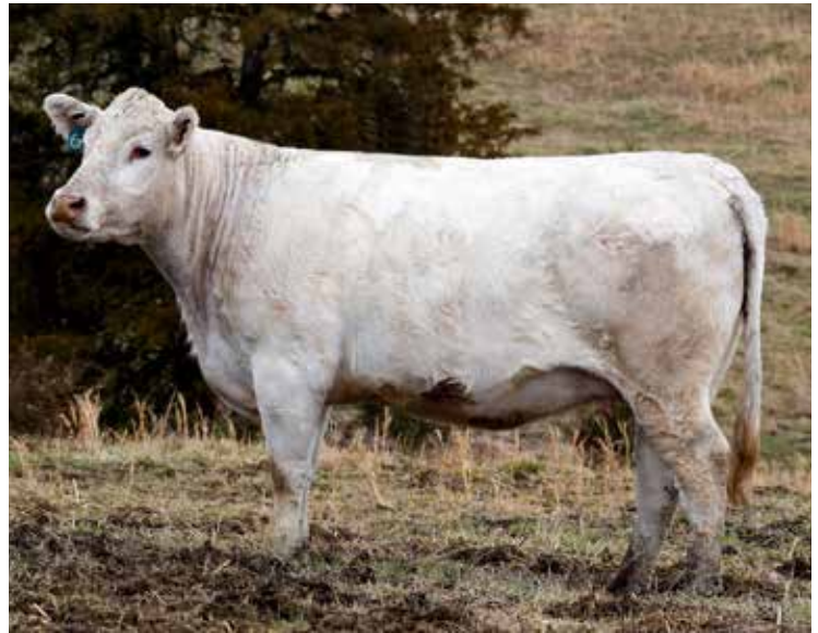
REAVES MS ABIGAIL 2255 SELLS AS LOT 27

PE bred to Reaves Mr GE Monticello 2345, EM1007981. A paternal sib to Major, the Canada and Denver Champion. EPDs rank in top 6% WW, 8% YW, 6% Milk, 2% MTL, 3% CW, 7% REA, 10% Marb, and 4% TSI at 290.98. Excellent conformation, deep, long-bodied, straight lines, square hip and highly feminine!