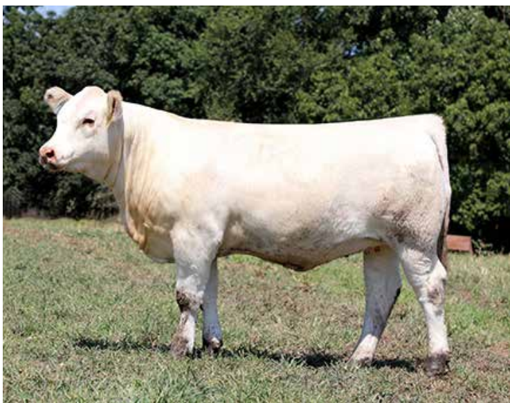
LCC TEXAS PROUD MARY 1741 DAM OF LOT 35

PE to Reaves Mr GE Monticello 2345, one of M6 Cool Germaine 1145's 90 progenies that she has produced. 2338 combines two of the best females to come out of the M6 program, 1145 and M6 Ms 761 Nancy 6100 P ET. Ms Law is also line-bred to M6 New Standard 842 to lock in those proven genetics. Her EPDs rank her in the top 20% for CE, 25% REA, 15% Marb, and 20% TSI.