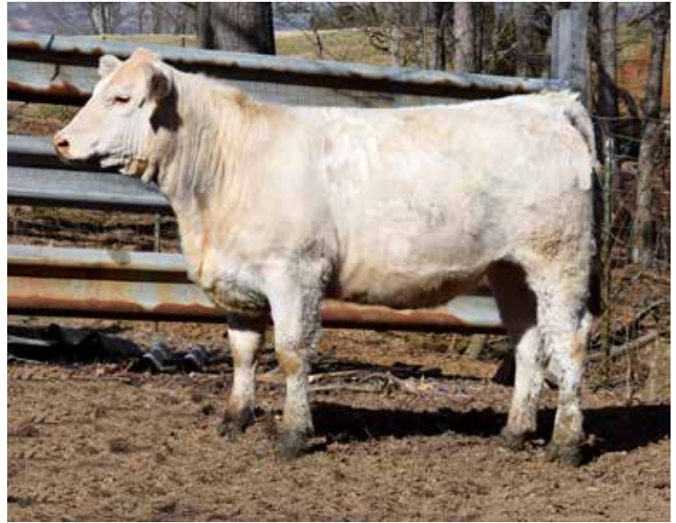
MILHORN'S MISS RINGER 2301 SELLS AS LOT 16