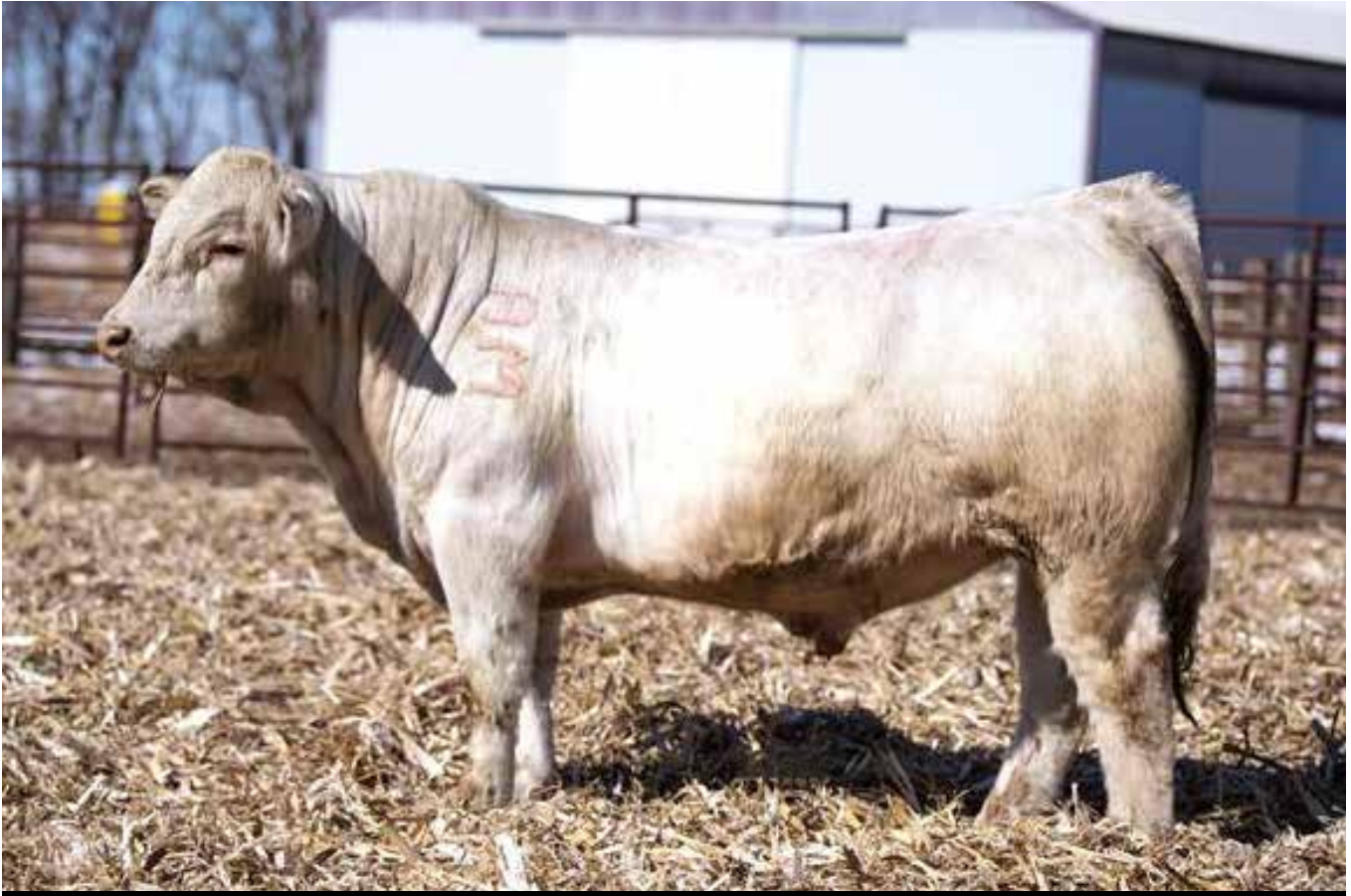
WCR GAMBLER 1167 P – SIRE OF LOTS 37-39