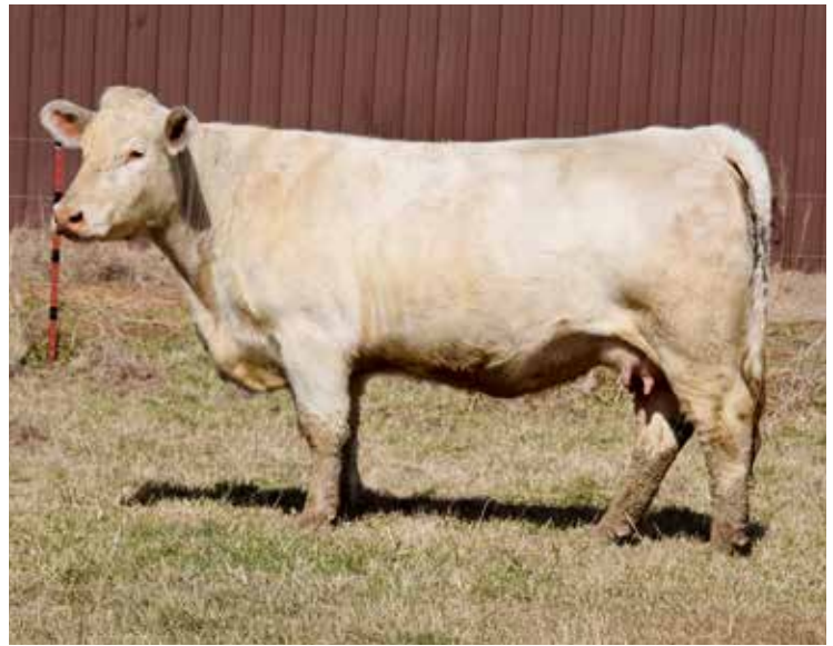
SC MS KATE 0028 ET SELLS AS LOT 26

26A&B: Polled Twins, Bull and Heifer calf, born 2/26/25 and sired by Fink 2230 of 77 467. Kate is doing a great job raising twins and it will be a 3-n-1 lot, you will get all three! Kate is a very feminine, long-bodied cow with tremendous stretch, depth, and big square hip! Royal show pedigree with Outsider and 0641 donor cow! EPDs rank in top 8% WW, 9% YW, 20% MTL, 20% CW, 25% REA, and 35% TSI for breed comparisons.