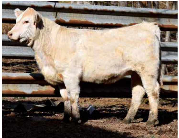
MILHORN'S BIG STANDARD 2304 SELLS AS LOT 17

Breeding status to be announced at the sale on this younger heifer. Super design of strong maternal look to this prospect! Good depth, length, and natural thickness in this eye-appealing heifer. Not a big EPD package here, but you can tell the quality is abundant along with good performance that makes for a profitable operation. Breeding to Master Chief will send the EPDs on her calf to a highly acceptable number!