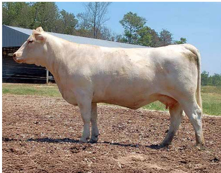
ORR'S MAUREEN 312 P ET GREAT-GRANDDAM OF LOT 29