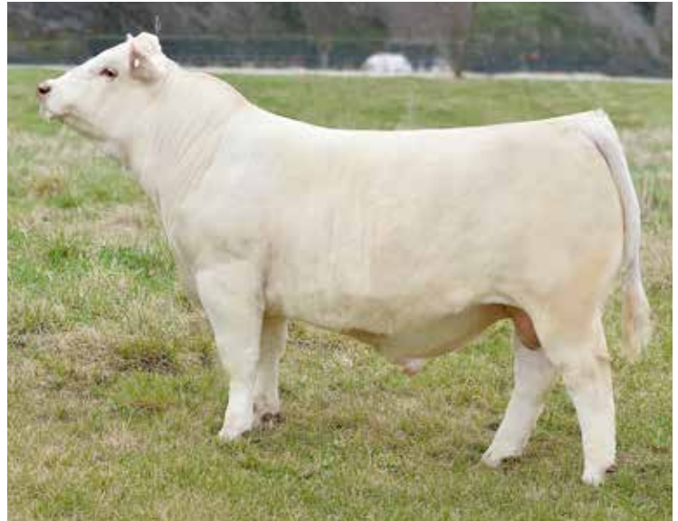
CCC WC RESOURCE 417 P SIRE OF LOT 28

28A: Pld bull calf, born 2/27/25, sired by Fink 2230 of 77 467. The Maureen cow family has been an integral part of the Reaves program. The lot 29 is a maternal sib to Dolly. The dam, 310 has produced 9 calves, her dam, 280 has produced 5 calves and working for Cawley Cattle Co., and her dam 312, was in the Arlitts ET program and produced 14 calves. Dolly ranks in top 20% Milk and MTL, top 15% REA and TSI for Breed EPD rankings.