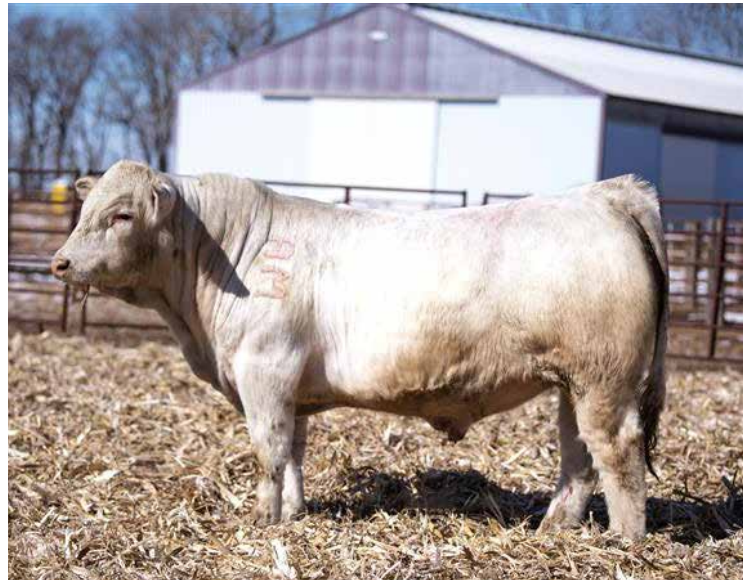
WCR GAMBLER 1167 P SIRE OF LOT 15

Bred A-I on 1/23/25 to WCR Master Chief 037 P; PE from 2/15/25 to sale time to Reaves Patriot 2271. A maternal sib sired by DC/CRJ Tank E108 P, sold to York Cattle Co, GA, in the 2024 Appalachian Sale. The 5003 donor has produced 54 progenies, many playing important roles in the breed. 2300 ranks in the top 35% WW, 25% YW, 8% Milk, and 9% MTL for the breed EPD comparisons.