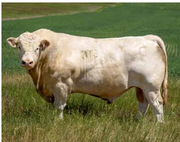
DC/CRJ TANK E108 P SIRE OF LOT 6

Sells Fertility and Trich Tested. Selling Full Interest and Full Possession Smooth, very complete bull with superb eye-appeal and style! Dam was in the ET program for Jerry Vaughn, KS. Dam traces to the great donor at Double-H, M6 761 Nancy 6100, that produced lots of high selling cattle for M6 and Double H. 2400 also ranks in the top 20% for Marbling EPDs. A super heifer bull in design and pedigree!