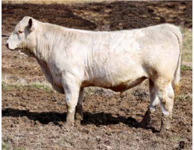
REAVES MR JOE VALUE 2422 SELLS AS LOT 10

Sells Fertility and Trich Tested. Selling Full Interest and Full Possession A maternal sib sells as Lot 33 sired by Hondo. The dam is a super addition to the Reaves ET program was a top selling cow in the Finks Sale at $30,000.00+. I hope you study this bull well, he shows tremendous future, with good extension, length, skeletal correctness, and with this pedigree you will develop some of the greatest females in the breed!