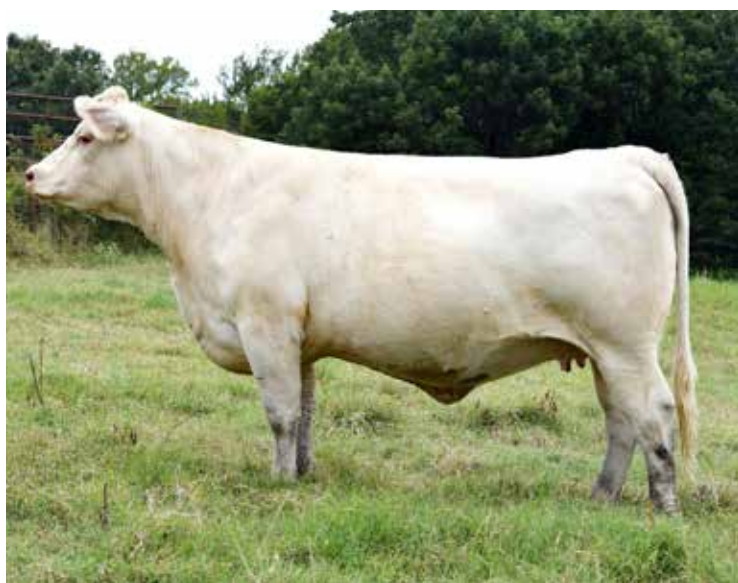
DCW LADY E9192 DAM OF THE SIRE OF LOT 53