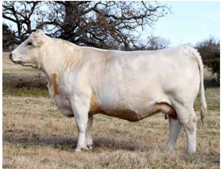
NH LADY 7450 0409 FL DONOR DAM OF LOT 61

Selling 3-Conventional embryos from mating of JMAR Hosea 2M70 x NH Lady 7450 0409 FL Est EPDs. Hosea is rated top 1% Marb and 7450 rated top 9% Marb along with 7% CE and 10% BW. A full sister to 7450 produced the high selling bull in Herndons 2023 Bull sale. Tremendous donor, good fertility, excellent disposition, superior udder quality, both are PAF.