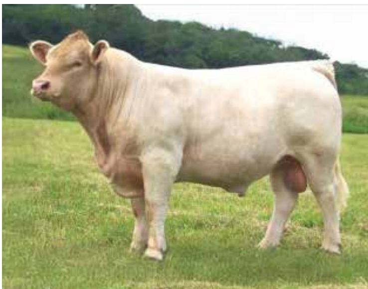
WIA MANTRACKER 150 PLD GREAT-GRANDSIRE OF LOT 20

PE bred from 7/1/24 to 1/1/25 to Flag Pond Braxton, M969654, safe in calf. Maternal sib to lot 18 and out of a sire that has over 1100 progeny registered with AICA. His calves still command top prices. In the 2024 Sale of Excellence, one of the more contested selling individual was a President daughter, RE Lady Spur 24 ET. Several tried to buy her after the sale. Ivanka will make a super brood cow with plenty of Milk, Performance, and Volume.