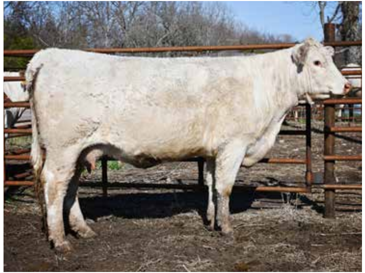
FINK MISS 0447 7532 BF

Bred A-I on 1/26/24 to Tri-N Bob Dylan 201K. A 7/8 sister in blood to Lot 69, a definite family to assemble to make an elite breeding program. Especially those that might want to create a home-based "Meat-Market", with this kind of carcass genetics. People have built programs around show cattle, performance cattle, and this could be your carcass cattle program! Another top numbers Charolais.