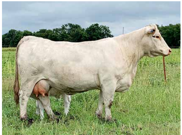
SOUTHERN NANCY 62092 LOT 55 DONOR DAM