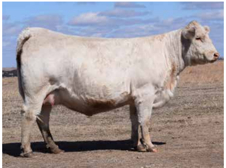
LCC MISS LADY 0464 7753 GS