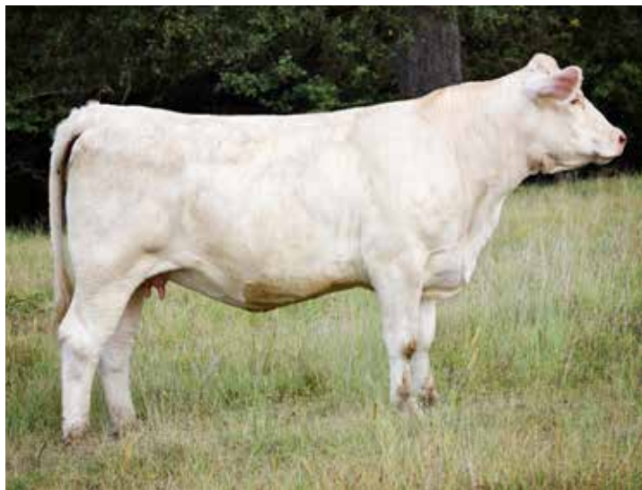
RS MS FRISCO G4