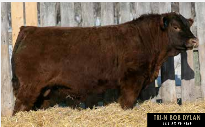
TRI-N BOB DYLAN LOT 63 PE SIRE

Super heifer calf at side, will not be sold, retaining in our herd. PE from 12/30/23 to 4/1/24 to Tri-N Bob Dylan, QM202732, (red Charolais). The illustrious dam of JDJ Maximo A18 P, homozygous Polled Sire! Also, the dam of RE Destiny 747 P ET, (Lots 34-36). With 42 calves registered with AICA, this magnificent donor, (PAF), has excelled many times in production. First bought by Sparkman Cattle Co, then sold in a previous Sale of Excellence for $27,000 to Holloway and Aristo. A calf by her and Bob Dylan could become one of the most sought-after genetics in the red world! Y322 actually milks enough to raise two twin bull calves for Sparkman that weaned off over 650 lbs. Still has a sound, correct udder!