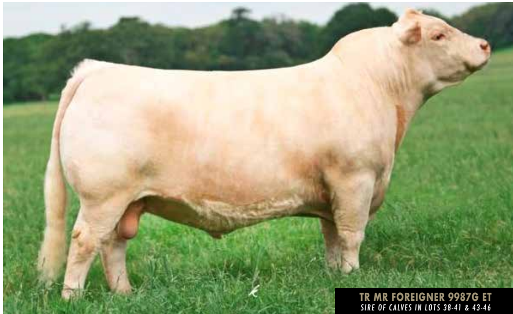
TR MR FOREIGNER 9987G ET SIRE OF CALVES IN LOTS 38-41 & 43-46