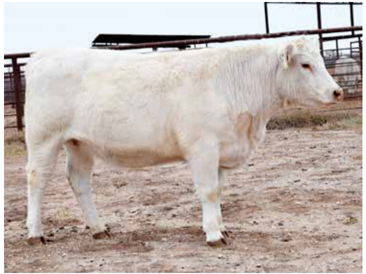
BARA MS 524 DYN TANK 11K P

Bred A-I on 3/7/24 to JMAR Jubal SP01. Super cow family on bottom side as Ms Dynasty L428 was a featured Donor cow at Evans, Hyde, and Biggs. She produced until 18 years of age and had 88 progenies registered with AICA. Evans has used a full brother to 524 in their program with great success. Solid consistent numbers, ranks in top 30% YW and Milk, 9% MCE, 45% MTL, 25% for CW, REA, and TSI.