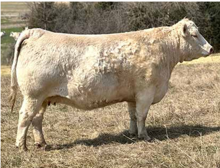
LCC MISS LADY 8858