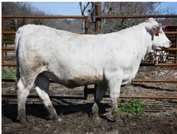
MSF GOLDEN LP060