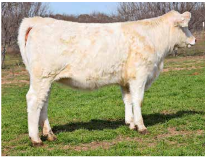
BAF JUBILEE 418L