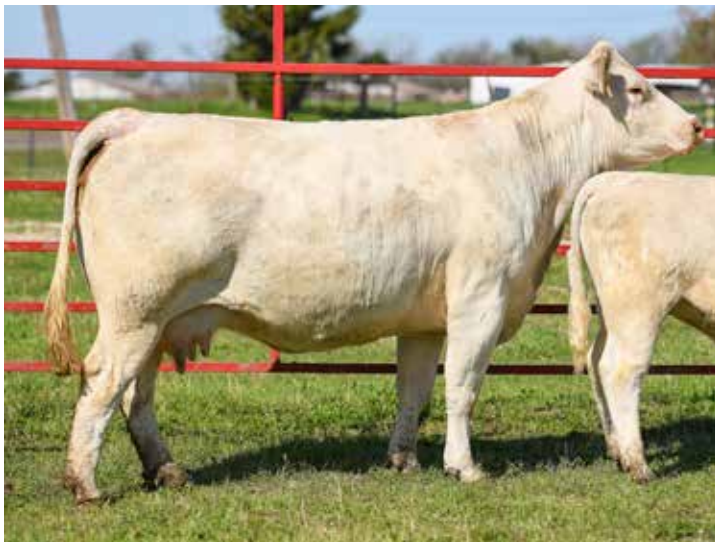
SC MS BENDAS FARGO 855 P