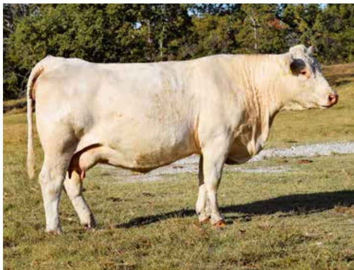
FINK PERFECTION 9315 3833 GS LOT 33 DONOR DAM