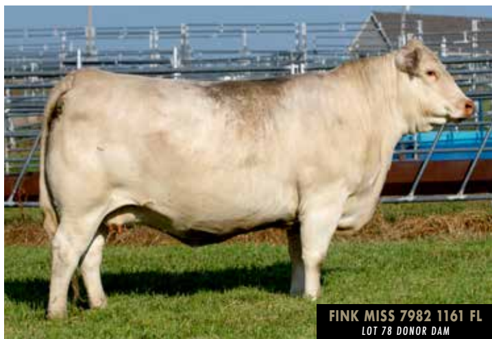
FINK MISS 7982 1161 FL LOT 78 DONOR DAM