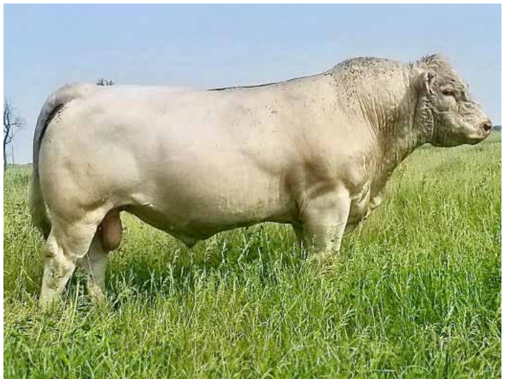
JMAR BENAIAH 1E66 SIRE OF LOT 71

Bred A-I on 1/27/24 to Tri-N Bob Dylan 201K, a homozygous Polled bull and PAF. He was also the high-selling bull in Tri-N sale in 2023 at $23,000. Incorporate the hottest of red genetics with the strong carcass genetics. She ranks in the top 2% for WW and YW, 25% MTL, 2% CW, 10% REA, 30% Marb, and 3% TSI for EPDs. Notice the 108% ration with 21 contemporaries for weaning wt! Benaiah has been very prominent and successful for Eggleston Charolais.