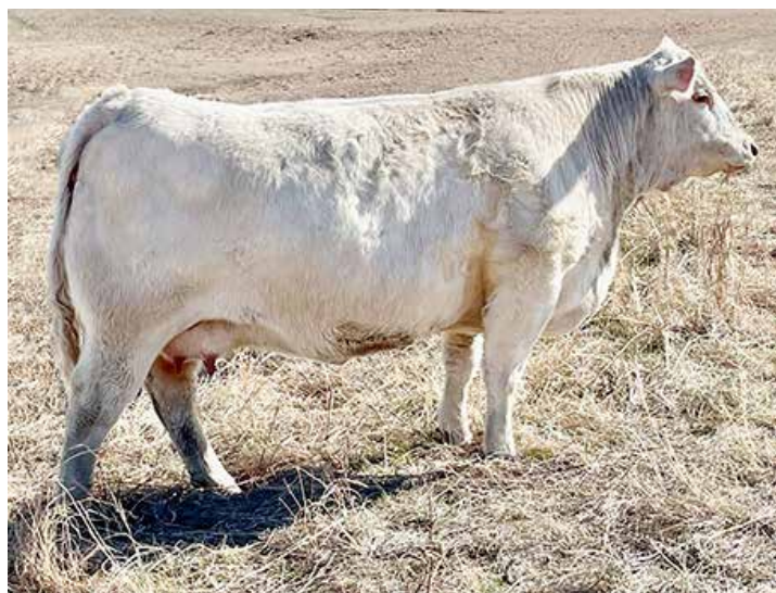
LCC MISS LADY 8857 6868 FL LOT 64 DONOR DAM

Selling a pregnant Recipient with mating of WCF Mr Silver Gun 467 x LCC MISS LADY 8857 6868 FL. Recip due 8/1/24, This is the donor cow that sold for $33,000 in the 2024 National Sale in Denver to Riverdale Land & Livestock, MO. Described as one of the most complete and "perfect" cows in the breed. She is PAF and Silver Gun is both PAF and homozygous Polled. This could become your next herd sire or donor! Impeccable pedigree, her dam 6868 is a stalwart of the Fink program and has produced 109 progenies. A highlight lot!