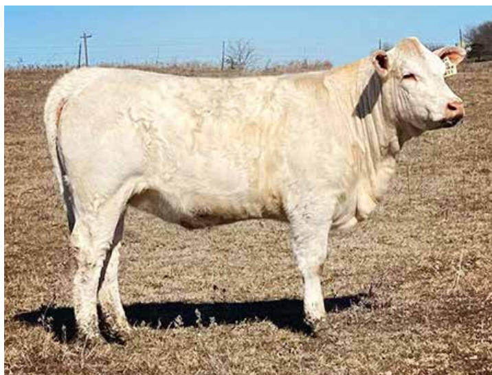
MC MS DEFIANCE 211