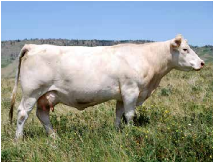
JDJ MS SPUR R120 MATERNAL GRANDAM OF LOTS 17-20

16A: Pld heifer calf, 19L, born 11/18/23, bw 73, sired by JMAR Jubal SP01. Tremendous Braxton daughter with good udder quality and calf raising ability! Her dam, 4E, is out of a super producing Tradeline daughter from the Arlitt herd. S3017 was in the Arlitt ET program and produced 18 calves, two natural twins. The Tradeline N114S was considered one of Trademark's top sons in DeBruycker program.