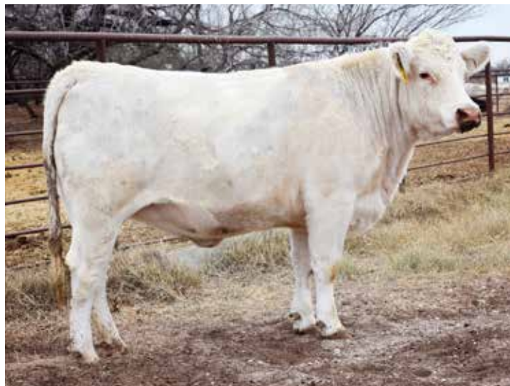
BARA MS B2011 TANK 2K ET P

Sells bred A-I on 3/7/2024 to JMAR Jubal SP01, M953191, PAF, and homozygous Polled sire. You love the power of this strong female, and yet feminine, high-volumed, with thickness, and easy-fleshing ability. She ranks in the top 35% for WW, 15% YW, 30% Milk and MTL, 15% for CW, REA, and TSI for breed EPDs. The Tank's have been great on calving ease for heifers and add to the EPDs. Jubal has also been a calving ease sire.