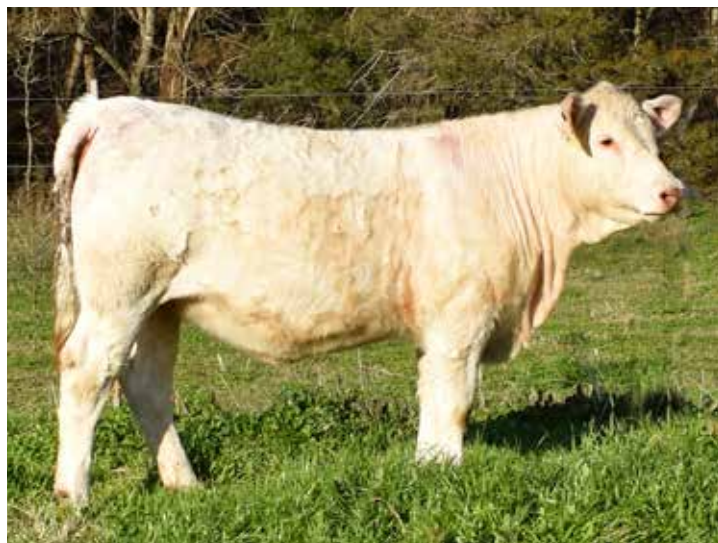
HF YADA YADA YADA LE433

Sells Open. Absolute powerhouse of a female. Sturdy made daughter of the homozygous polled King sire. Not only are his bull calves outstanding, but his females are becoming well known for their productivity. He has sired over 230 progenies. Gloria 108 is a tremendous cow in her own, being out of Smokester and a Cooley Jackpot sire. She produced 9 calves and a full sister is in the Pinecrest herd in GA