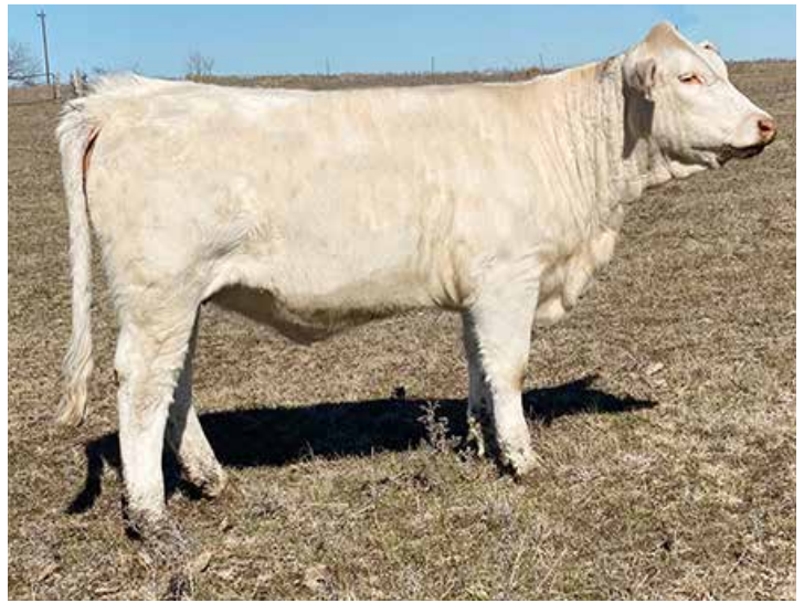
MC MS DECATUR 213

Sells bred A-I on 2/2/24 to DC/CRJ Tank E108 P. This heifer traces back to HBR Lady Liz 721, the dam of JWK Impressive D040, the National Champion Bull. She is also double-bred Shurshot 1107F7 on the bottom side. Perhaps just a touch more bone in this heifer, but still same great stylish pattern of eye-appeal with plenty of muscling, depth and spring of rib, and great skeletal correctness. All 3- in 80 lbs bu.