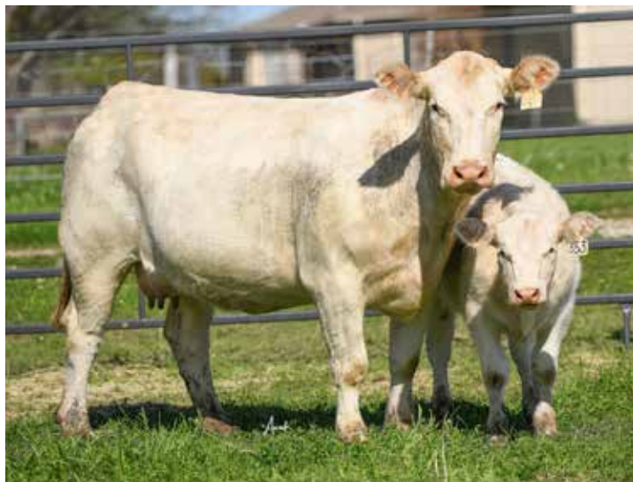
SC EASY REWARD 951