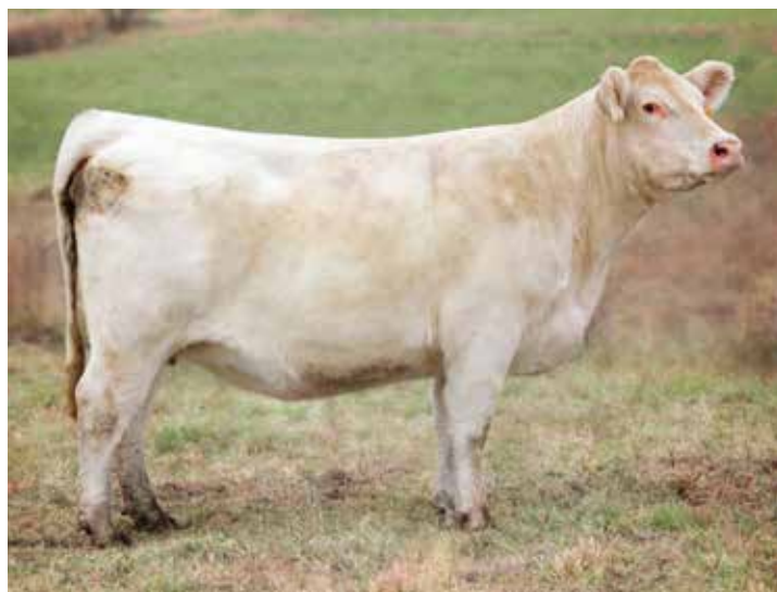
RE MS B2011 OUTLIER 090 ET

61A: Pld bull calf, born 1/26/24, sired by CCC 2B Gunslinger 9030 P, M930782, a homozygous Polled sired by WC Inferno 6561 P. The 090 is PAF and Homozygous Polled. A tremendous stylish and complete daughter of the great donor, JDJ Ms Cigar B2011 and a National Champion bull that is siring a great many of the Purple winning show cattle today. This great brood cow has the genetics to raise a lot of winning show cattle! She ranks in the top 4% WW, 2% YW, 25% CW, 1% REA, and 4% TSI. Bull calf will have abundant value with this stout pedigree!