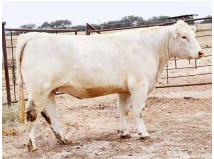
ABC SWISSER SWEET 112

Bred A-I on 1/6/24 to JMAR Jubal SP01. Strong show genetics combined with M6 lineage used in Edward Salter's program in GA. Outsider and Firewater have been two of the most winning sire pedigrees in Charolais for purple banners! The offspring of their genetics have completely dominated the showing. This ultimate feminine, extended neck, classy female possesses the ability to produce many more champions!