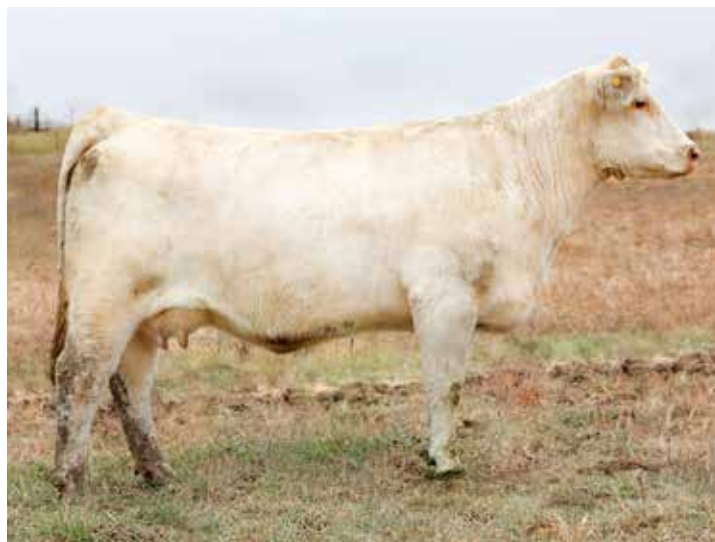
LCC MISS ELSIE 1871

Lot 60A: Polled Heifer calf, born 8/5/23, sired by CR/NC Uno Mas 3560 E10 P ET, PAF, Homozygous Polled. Elsie is PAF and has that super eye-appeal that explodes with Tank progeny! A light birth wt. but follows with a tremendous WWt of 652 and YW of 945 with a 108% ratio. With the Milestone and Tank genetics you can rest easy about calving ease. Two of the best for calving! Uno Mas is a Cavender sire by Milestone & Clarice J139 daughter.