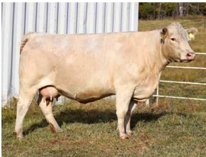
LCC MISS LADY 8872 4297 GS LOT 24 DONOR DAM

ET heifer sells open. Her PB recip, # 98, F1283415, sells bred, implanted with embryo from mating of RBM Keystone H41 x LCC Miss Lady 8872 4297 GS. (EF1275494-Gold Standard x Free Lunch), DUE 9/28/24. WOW, what a package here. An ET Tank heifer out of a full sib to JDJ Maximo A18! Then a great embryo in the recip from one of Fink's top selling lot in their fall 2023 sale, 8872, Pictured! Keystone is a top 2% Marb and 8872 is a top 1% Marb. They also excel in growth, calving ease, and both are PAF.