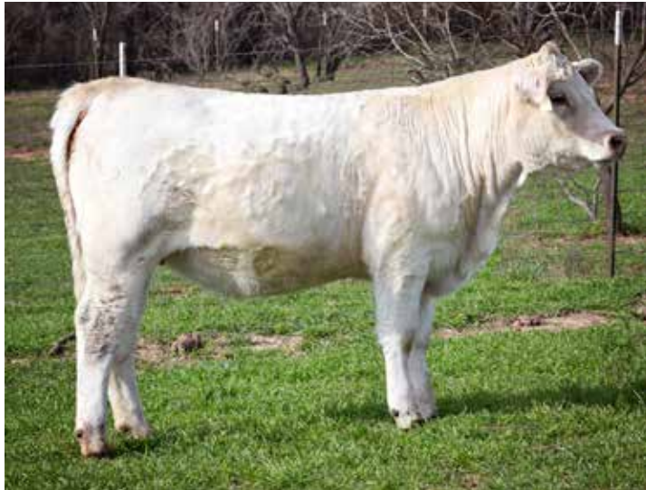
RE BRAX DYNASTY 271

SPARROWS BRAXTON 519C RE SIR BRAXTON 022 ET EM938665 JDJ MS CIGAR B2011 P ET RE CIGARS DYNASTY 72 ET RE MS DYNASTY 036 F1303500 BARA MS MAX PRESIDENT 35C P