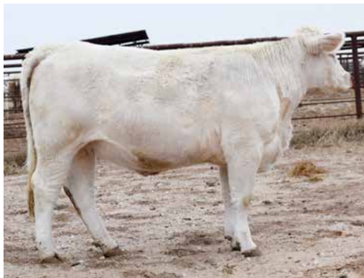
BARA MS 303 CIGAR 38J ET P