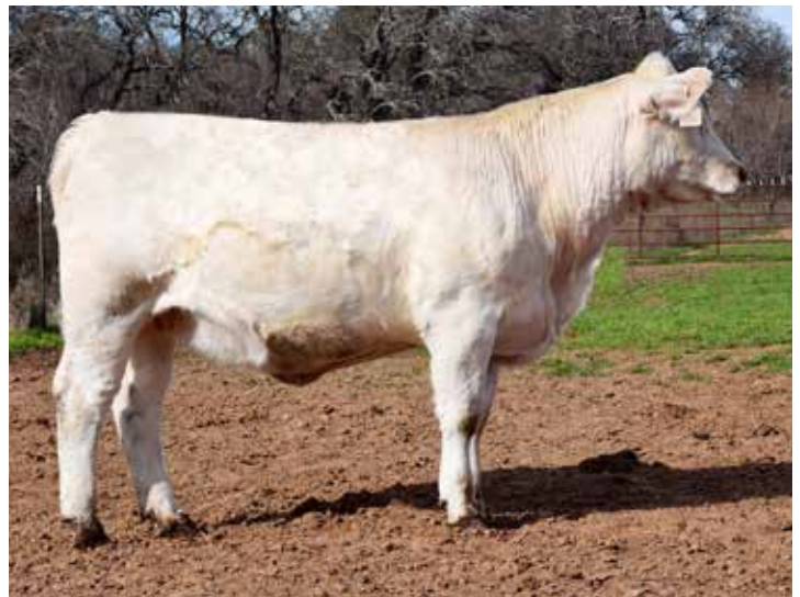
RE B2011 CORNERSTONE 210

Sells bred A-I on 2/16/24 to DC/CRJ Tank E108 P. This was B2011's natural calf from a clean-up sire! But that sire descended from another great foundation of RE Ms Duke 34, a great producing donor for Evans out of the immortal, CR Ms Duke 172. 34 produced 59 calves and several of those sold for $15,000 on bull calves and females. Several of her daughters went into ET programs. She produced until 18 years of age!