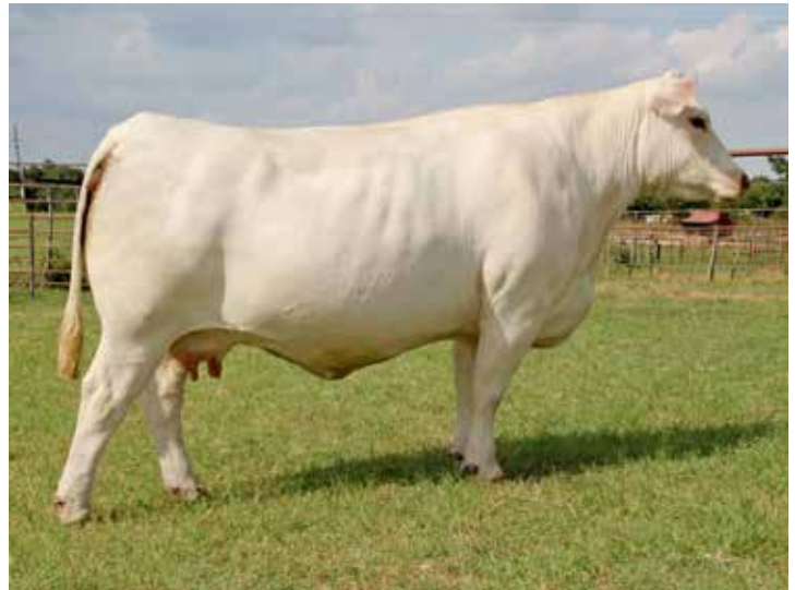
M6 COOL GERMAINE 1145 P ET LOT 53 DONOR DAM