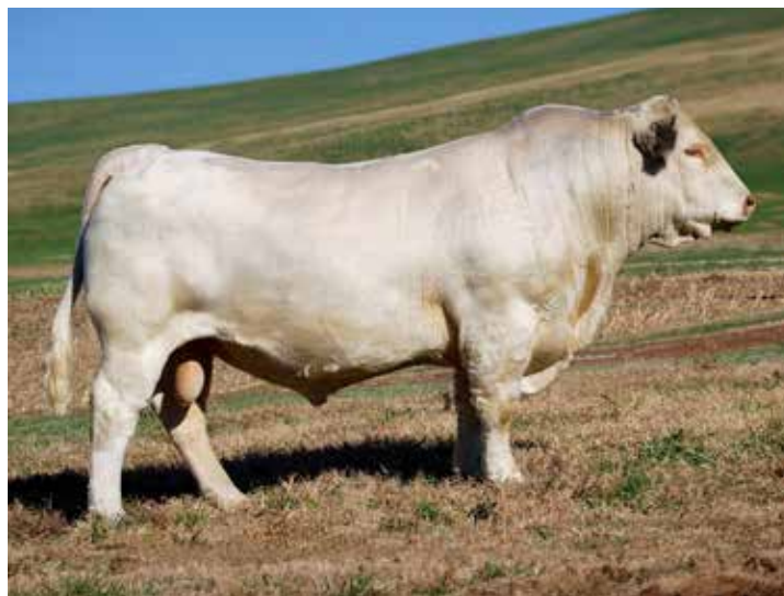
VPI FREE LUNCH 708T SIRE OF LOT 65

Bred A-I on 1/25/24 to Renn Cowboy Romeo; PE from 1/31/24 to Tri-N Bob Dylan 201K (calf may have to be DNA tested). A full sister to 3834, produced the Lot 283 in Fink's fall sale going to Arlitt, Allen, Bella Angel, & Evans. (see lots 23 & 33) Super numbers, ranks in top 8% CE, 4% WW, 3% YW, 8% CW, 6% REA, 1% Marb, and 1% TSI. She has produced 46 calves and has the credentials to star in your ET program.