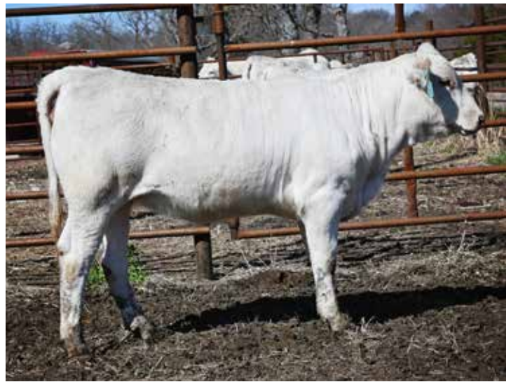
LCC MONTANA KYLA 9913

Sells Open. Hosea progeny is acquiring great friends. They are very complete, with muscular build, volume, and sound structure. Notice the progression of marbling sires, Free Lunch passes on to Monticello and blended with Lock & Load! She ranks in top 3% for Marb. Light birth wt displayed by actual and EPDs ranking in top 8% CE and 7% BW. Ready to breed.