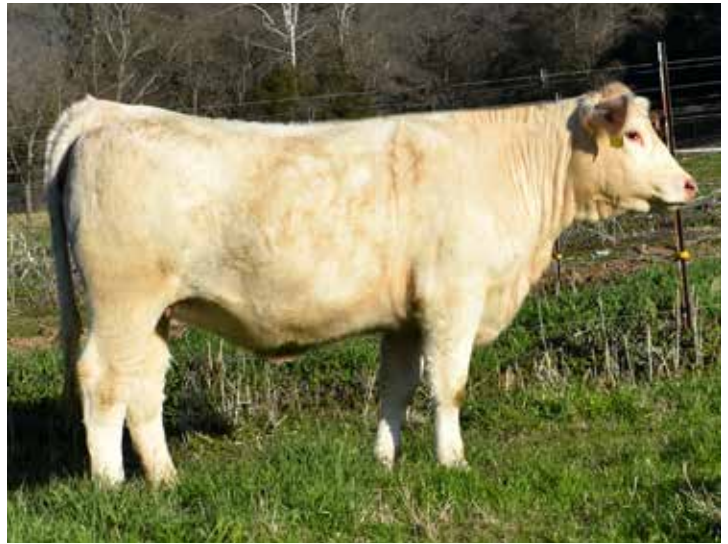
HF SWEET NELLIE L873 PLD

Sells Open. A big stout made heifer with big square hip, great volume with deep body and spring of rib. With Smokester in pedigree you know she will milk, top 7%, and good REA, top 25% with 15% CW, and 20% TSI EPDs. Tank is being used all over the breed from largest breeders to smallest because they just work! Easy calving as well. One maternal sib in Evelyn Gay Lawton's herd, LA. Quite a special heifer here!