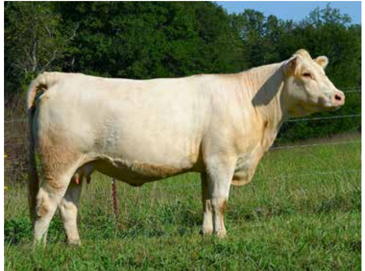
WC LADY GAGA 031 P DAM OF LOT 76

Bred A-I on 1/26/24 to Tri-N Bob Dylan 201K. Sired by a son of Silverstream Evolution that adds tremendous thickness, volume, and capacity to his progeny. Lady Gaga is one of the best daughters of BHD Sly Illusion that help to change the acceptance of Charolais bull market in the Carolinas. Genesis' dam, BHD Ms Zeus B25 is an outstanding brood cow and probably should be in an ET program!