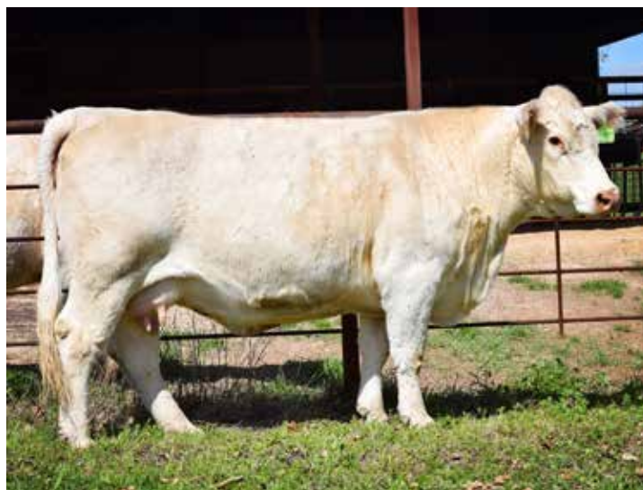
RE EQUAL DYNASTY 418 ET LOT 26 RECIP DAM AND DAM OF LOT 27

Open ET heifer sells with PB recipient, RE Equal Dynasty 418 ET, EF1186708. Another great daughter of our tremendous donor, BHD Ms Cobalt Z767! Jubilee is a maternal sib to lot 25, and paternal sib to Lot 27. Two great donors contribute to the success of this top heifer, BHD Ms Cobalt Z767, the $20,000 Pick of DeBrycker's from a previous Sale of Ex and Jubal's dam, JMAR Ms America, a Free Lunch donor cow.