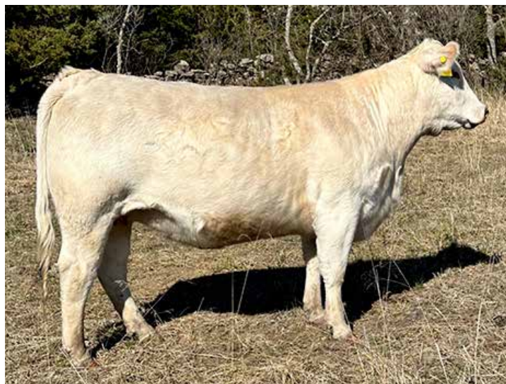
FINK MISS 242 7982 NS LOT 80 DONOR DAM

Selling 4 IVF Embryos from mating WCR Silver Gun 467 x Fink Miss 242 7982 NS. Full sister to Lot 79 donor and the $41,000 sib at Fink Cowntown. These two daughters represent the heart of our program, and we could only contemplate selling their dam in April by knowing how good these two daughters can replace her! It takes years to get a real working program established and you can leap the time frame by using tomorrow's genetics TODAY! Galen said I really liked these two females when I was there last fall but was probably eating too much ice cream to remember them!