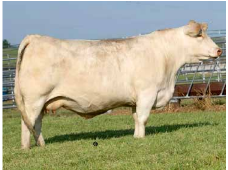
LCC MISS LADY 8008 GS

Some possible daughters of cows listed above