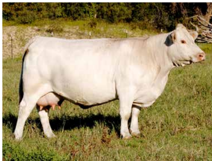
RHC MS HAVERSHAM MATERNAL GRANDAM OF LOT 52