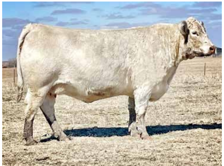
LCC MISS LADY 982 OF 6868FL