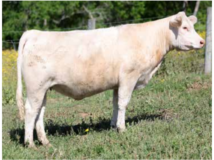
SVR CIGARS OUTLIER 209K

Bred A-I with sexed bull semen on 12/9/23 to LT Justified 1528, M963051. Justified is a son of LT Badge and Ledger dam. He is homozygous Polled. Boy Outlier 812 had a very successful show career and then was AICA's 2nd in Top Ten Show Sires of the Year in 2022-23. The 2nd place in Show bull of the Year was a Boy Outlier son, and the top 3 Show Females of the Year were sired by Boy Outlier daughter. Winning Pedigree!