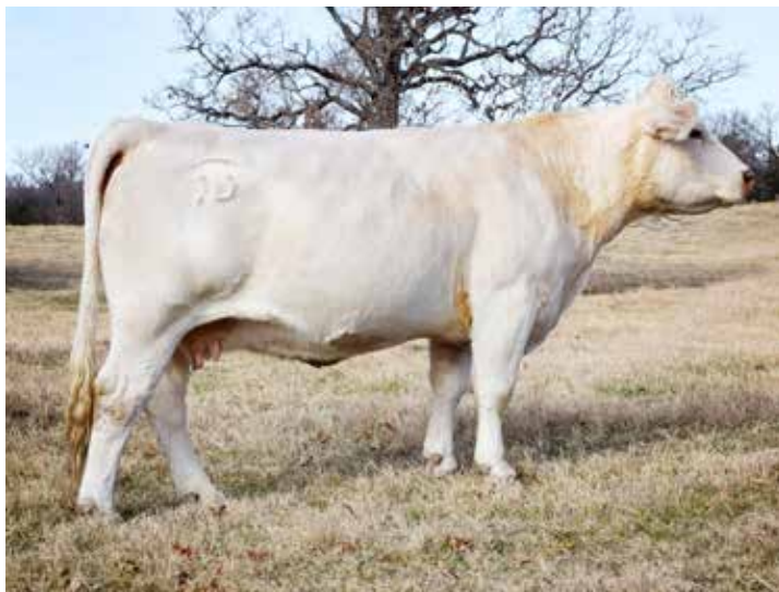
BHD MS SMOKINLEONIDIS D413

LHD LEONIDIS T728 SM SMOKIN LEONIDIS A831 P M850443 SM MS SMOKINSISSTERR573P BHD ZEN X270 P BHD MS ZEN Z134 F1164403 BHD MS INFANTRY W3025