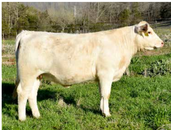
HF QUEEN L108