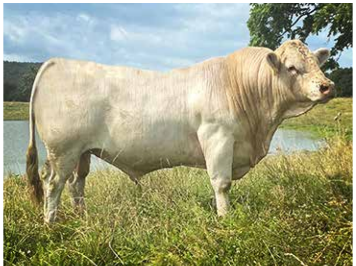
HF RICOCHET G13C MATERNAL BROTHER TO LOT 49

Sells Open. We're using a maternal brother, HF Ricochet G13C, to this heifer in our herd bull battery! He is a great calving bull and his calves have been outstanding! As you can see, he is loaded with muscling, and correctness. Tremendous eye-appeal. Dam is an awesome Maximo cow tracing to Evans' great donor RE Ms Duke 34 on the bottom side. Ranks in top 35% WW, 30% YW, 15% CW and 20% REA EPDs.