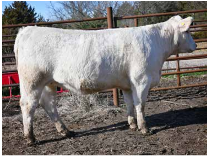
FINK DANTE 2111 9328 FLASH

Bred A-I on 1/27/24 to Tri-N Bob Dylan 201K. Another great EPD offering, out of the Flash/marbling genetic background. She ranks in the top 2.5% WW, 10% YW, 15% Milk, 10% MTL, 6% CW, 10% REA, and 1% Marb along with a top 4% TSI. Almost every trait, a major leader in the breed! If you want to make a dominant standing for carcass, maybe this is your foundation to promote such a program!