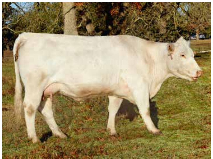
BAMBOO MS DUKE 1321- PAF LOT 21 PB RECIP COW

ET Heifer sells Open. Recipient is a PB Charolais, Bamboo Ms Duke 1321, F1152103, sired by M6 Grid Maker 104 and tracing back to JWK Victoria D027. 116 has been a featured Donor for Evans producing 25 calves, her dam, 916 produced 13 calves for Stalling, TN., and her dam C442 produced 31 calves for Stallings and M6's ET program. A solid background to build upon. Recip CI, 12/14; 2/16; 2/17; 3/18; 5/19; 5/20; and 7/21.