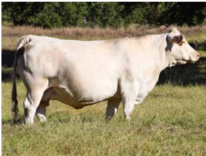
RE CIGAR GIRL 116 LOT 22 DONOR DAM