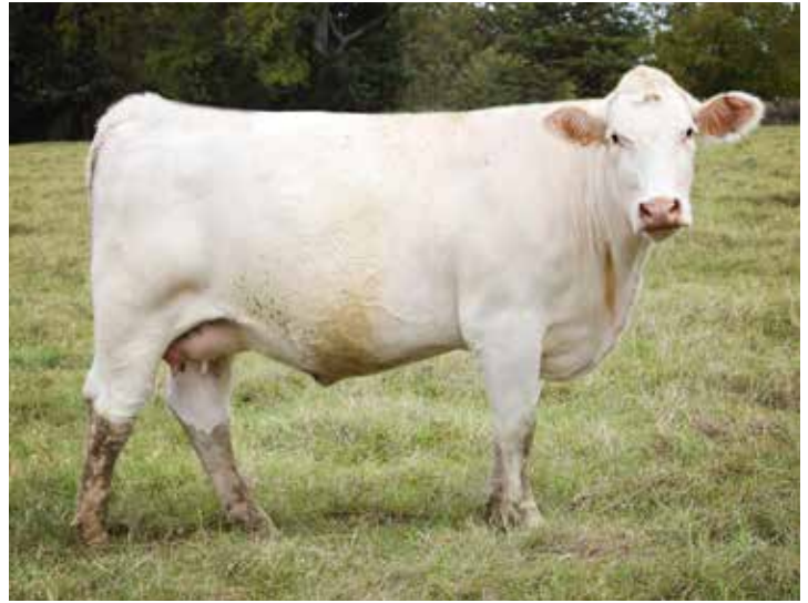
RS MS CURLY CIGAR F187 P ET

30A: Sells with heifer calf, born 2/14/24, sired by JMAR Hosea 2M70. A great producing Cigar daughter! Beautiful udder, 3-daughters remain in the herd. Her dam is the X292 Curlin cow that topped Sullivan's 2017 Spirit of Bluegrass sale at $20,000. Curlin's dam was K1509, one of the most impressive Cigar daughters of all time, so a line-bred Cigar here! If you want a producer, here she is!