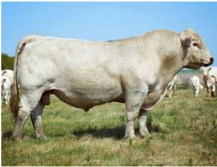
WCF MR SILVER GUN 467 SIRE OF LOT 66

SELLING PREGNANT RECIPI WITH SEXED MATING