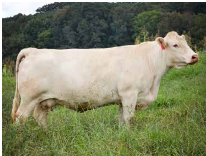
M6 MS NEW JEWEL 657 P ET LOT 56 DONOR DAM