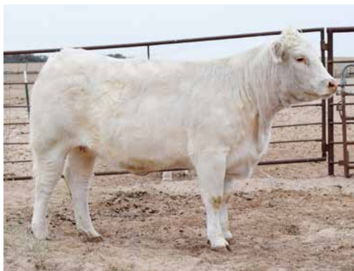
BARA MS 303 MANHATTAN 5K P

Bred A-I on 1/6/24 to DC/CRJ Tank E108 P. WOW, what a powerful mating on this superb brood cow. She may be as thick and you can find anywhere and yet still be correct, sound, feminine, and complete. Her abundant muscling and volume are most impressive. I think you will hear much more about this top prospect! She ranks in top 20% WW, 45% YW, 35% CW, and 4% REA for breed EPD comparisons.