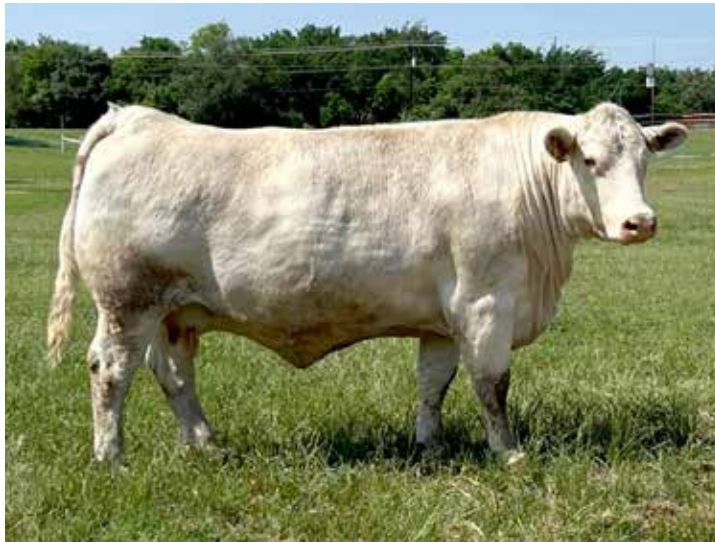
FINK LADY 3821 9521 FL LOT 73 DONOR DAM