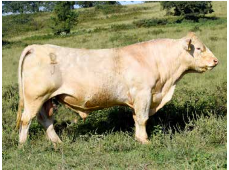
DC/JDJ PEGASUS D3330 P SIRE OF LOT 48 & 49

Sells Open. Pegasus is becoming one bull that's been proven over time. He sires more growth and performance than most! He is the sire of DC/BHD Shazam, DeBryucker's herd bull that had sired the top 2 bulls selling in their 2023 bull sale to LT Ranch. Maybe worth looking into if they like them! This top heifer also traces to a top Cigar x Ali Mark mating, the best of DeBryucker foundation genetics.