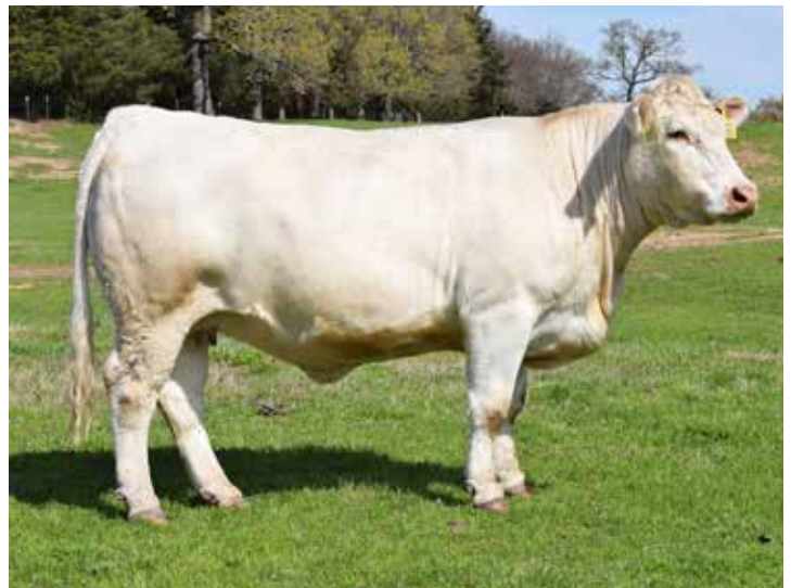
OHF SMOKING H816 ET LOT 32 DONOR DAM

Selling 3 Conventional embryos from mating of JMAR Hosea 2M70 x OHF Smoking H816 ET A superb blending of royalty genetics! Very resourceful numbers enhance this offering along with dynamic phenotype of design. A big, broody female, loaded with quality. Deep-volumed and good spring of rib, with correct structure and lines. Stout, yet feminine with good udder quality. Hosea continues to amaze breeders with such correctness, thickness, and style. He is homozygous Polled and both are PAF.