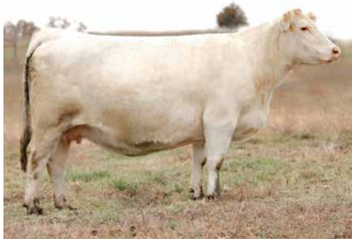
LCC TEXAS SAPPHIRE 3740

Lot 59A: Polled bull calf, born 1/8/24, sired by JMAR Hosea 2M70, PAF, Homozygous Polled sire. Daughter of the illustrious donor, RE Ms Duke 745 that sold in the Sale of Excellence with her heifer calf for $17,500.00. What a great investment! She has produced 40 calves that have topped sales all over the U.S. Her dam, Duke 34, has produced 59 calves, and her dam, Duke 172 had 50 calves. You want proven production and great fertility, here it is! Evaluate an outstanding bull calf at side for a herd sire! This cow is also PAF and homozygous Polled.