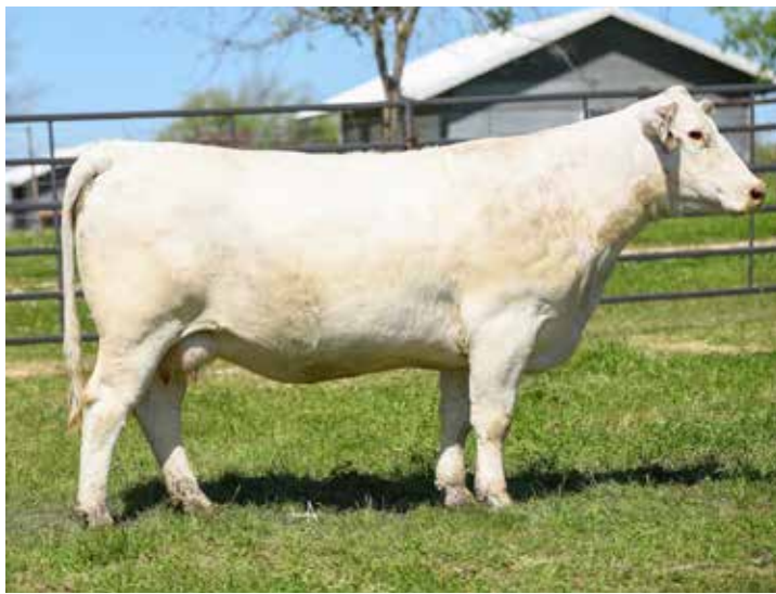
SC MS SUGAR RIDGE 805