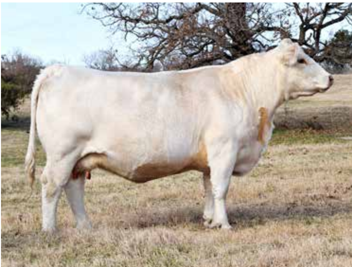
NH LADY 7450 0490 FL LOT 31 DONOR DAM

Selling 3 Conventional embryos from mating of JMAR Hosea 2M70 x NH Lady 7450 0490 FL Perfectly designed cow! Good sized, very feminine, big bodied with abundant depth and volume. Plenty of natural muscling and straight-lined top with super feminine extended neck. Absolute great udder quality, size, teat placement and attachment! A full sister to 7450 produced the high selling bull in the 2023 Herndon Farm sale! She ranks in top 5% CE, 6% BW, 15% MCE, and 5% Marb. Start with the best to get the best. Both PAF