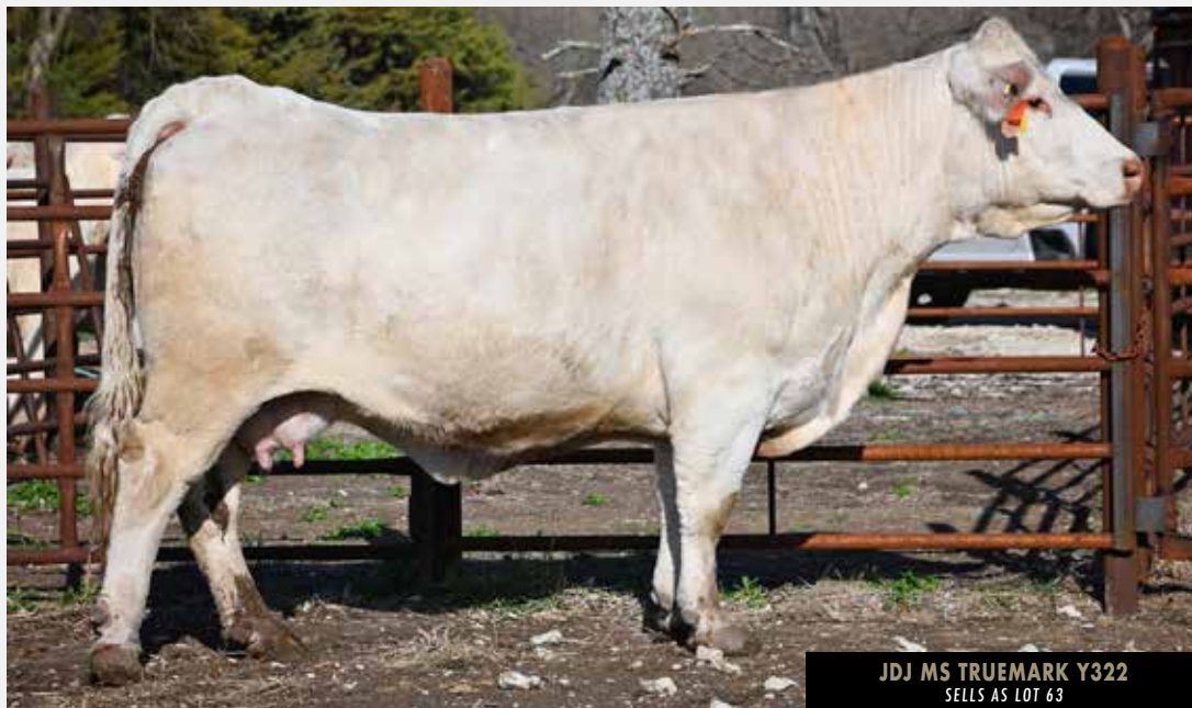
JDJ MS TRUEMARK Y322 SELLS AS LOT 63

Selling a guaranteed Flush in this tremendous donor! A daughter of the $245,000 Jebu, Malibu was our "Pick" of the Tri-N herd. A full brother just sold for $85,000, her dam sold for $50,000. The guarantee consists of a minimum of 7-embryos or a proportionate refund. Buyer gets all embryos produced. Flush to be at Cross Country Genetics, Manhattan, KS. All flush cost, freezing, etc. to be at buyer's expense.