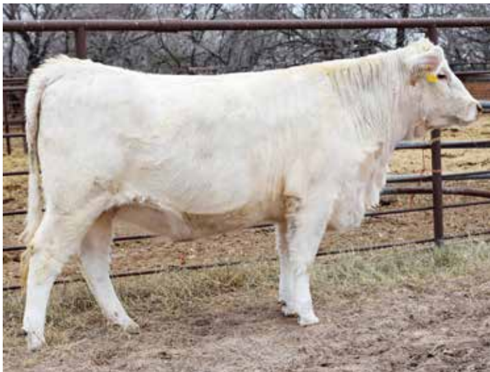
BARA MS B2011 PEGASUS 7K ET P

Sells bred A-I on 3/7/24 to JMAR Jubal SP01. Another broodcow designed female, plenty of volume, depth, and stoutness while maintaining the femininity desired. Her EPDs rank her in the top 25% for BW, 35% WW, 15% YW, 30% Milk and MTL, while top 15% for CW, REA, TSI. Jubal also adds calving ease and all report his calves have the best disposition of any Charolais they have had! Full sisters would make great addition to your herd.