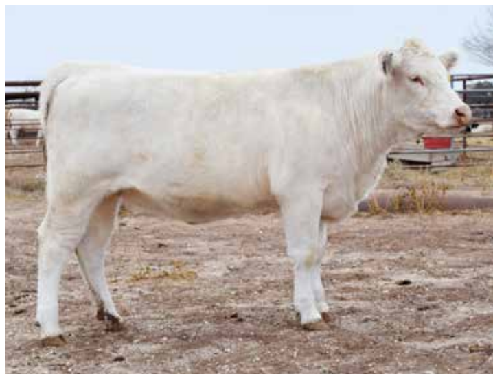
BARA MS 57Z TANK 10K P