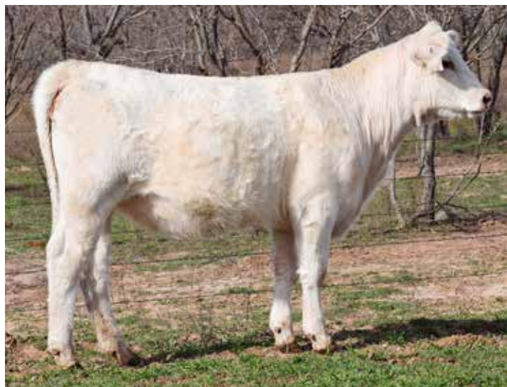
RE SAPPHIRE 295 ET

Sells Open, ready to breed. Semen from any Evans owned sires is available if you like. Tremendous potential to this maternal sib to DC/BHD King F2503 and DC/BHD Shazam, sire of the top two bulls selling in the 2023 DeBrycker bull sale to LT Ranch. She ranks in top 35% WW, 15% YW, 20% Milk and MTL. Top 10% CW, 15% REA, and 20% TSI for breed EPD rankings. She will become a jewel in any herd to excel!