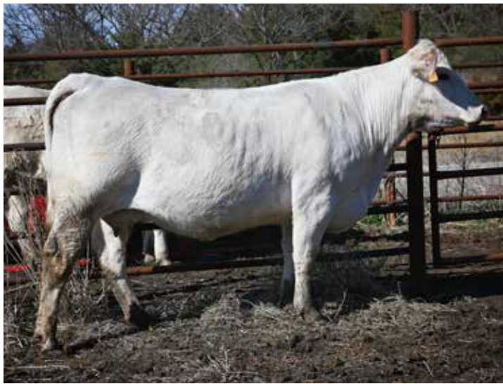
FINK LADY 1794 7757 L&amp;L