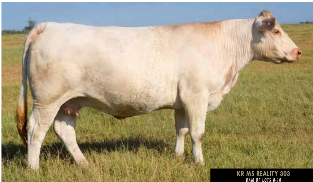
KR MS REALITY 303 DAM OF LOTS 8-10