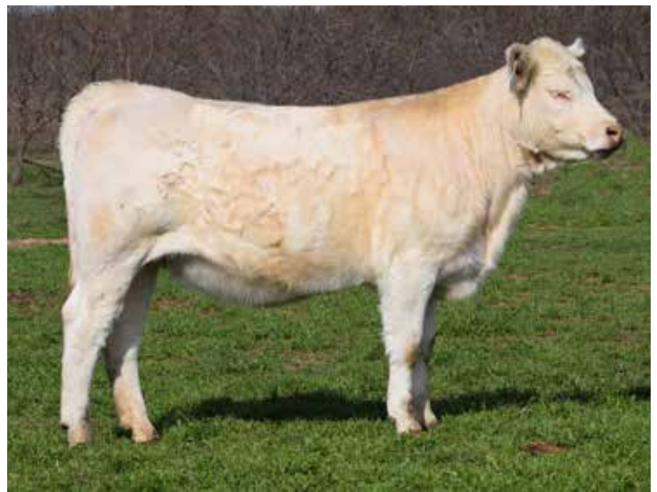
RE B2011 BELLA 290 P ET

ET heifer calf sells Open. Perfect age to take home and breed now. This complete, deep bodied, square hipped daughter of the very popular Tank offers a tremendous future! Great numbers ranking in the top 35% for WW, 15% YW, 30% Milk, 20% MCE, and 30 MTL and carcass top 15% CW, REA, and TSI EPDs. With the solid foundation of this pedigree, you can compete with any breeding program in Charolais!