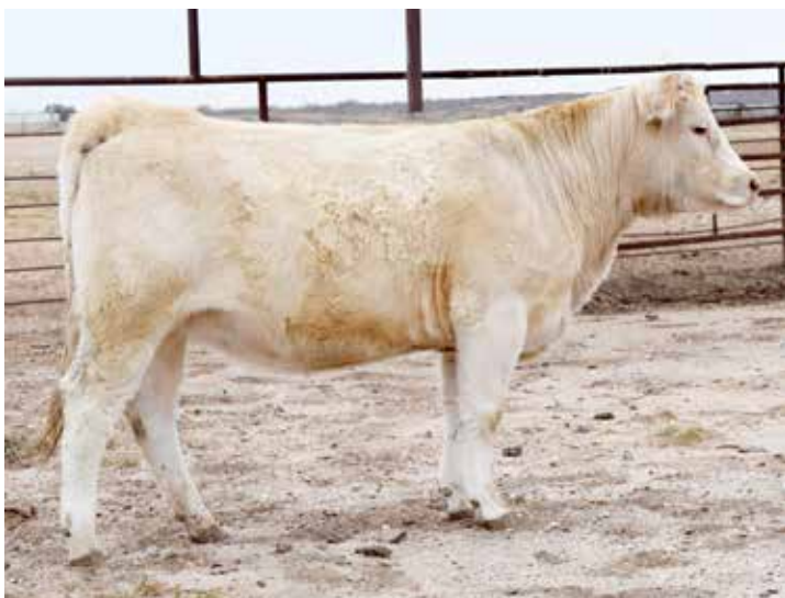
BARA MS B2011 PEGASUS 14K ET P

Sells bred A-I on 1/6/24 to JMAR Jubal SP01. Even sired by a different sire, you still see amazing resemblance to lots 4 & 5. Big bodied, with plenty of thickness and scale. These young ladies will be powerful addition to performance herds that sell pounds and growth! Pegasus is also the sire of DC/BHD Shazam that sired the high selling bulls in the 2023 DeBruycker bull sale. Pegasus' milk and perform!