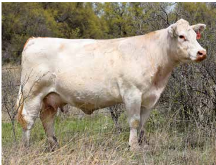
JDJ MS CIGAR B2011 LOT 18 DONOR DAM

ET heifer sells Open with a Brangus recip cow. A tremendous eye-appealing young heifer with a super pedigree of proven production. B2011 has been one of those "once in a lifetime". She has certainly been a top producer and very prolific. At 10 years of age, she has just calved, still sound feet and legs, beautiful udder quality. Everyone acknowledges these Blue Value daughters are awesome—this one should be even more so with her background!