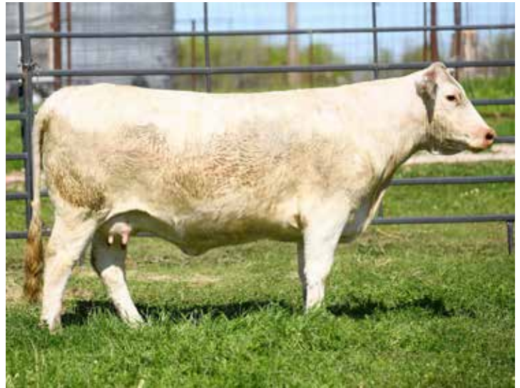
SC MS SILVER 703 P

41A: Pld heifer calf # 356, born 8/15/23, bw 72, sired by TR Mr Foreigner 9987 ET. PE from 10/17/23 to 2/7/24 to DC/BHD Megillah H33 P. Foreigner is owned with a syndicate. Megillah's sire, The Chairman, is out of a BHD Ms Grid N1749, the dam of BHD Cobalt S333, one of the stalwart sires at DeBruyckers. She was in Rocking S's ET program, and they sold Chairman to DeBruycker where he is still in service.