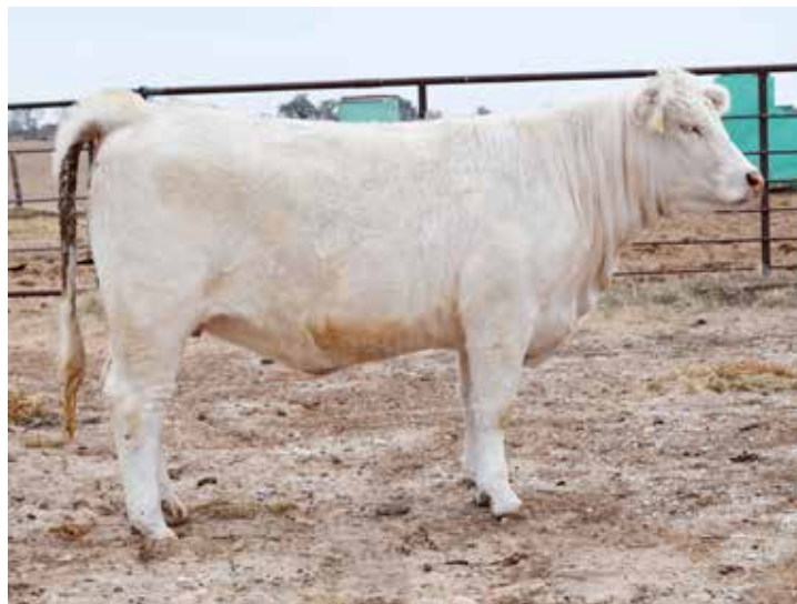
RE LADY SPUR 24 ET

FULL WEEKEND SCHEDULE AVAILABLE ON INSIDE FRONT COVER