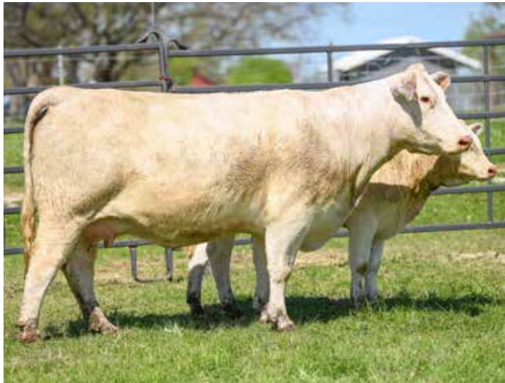
SC MS EASY ROYCE 806 P