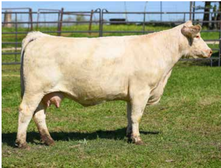
SC WHISTLE MAKER 854 P