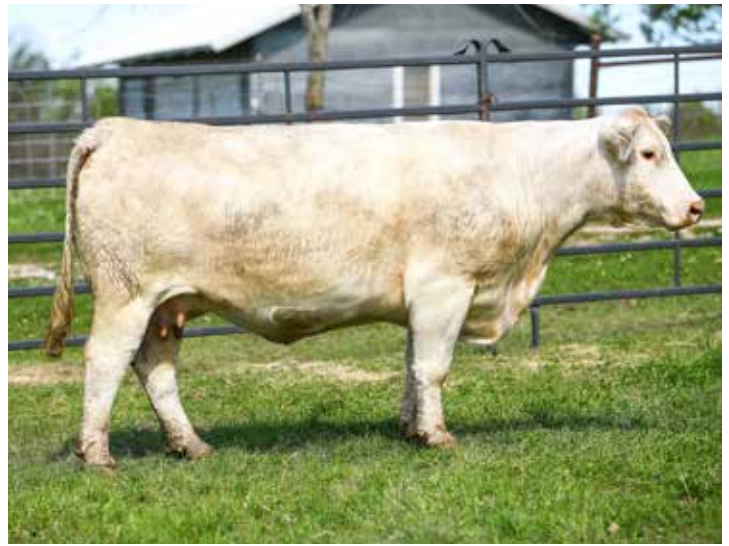
SC MS REWARD 709