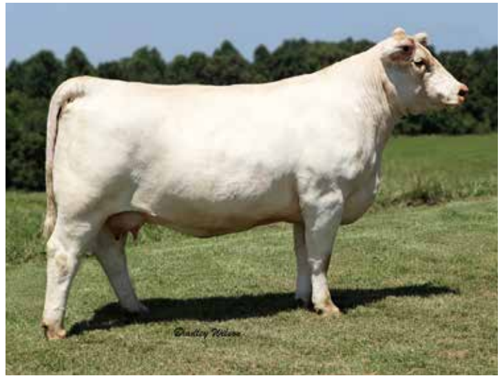
M6 NEW GERMAINE 5149 P ET LOT 54 DONOR DAM

Selling 8 IVF Embryos from mating of PVF Ridge 7142 x Southern Nancy 62092. Ridge has been one of the hottest bulls in the breed, used by many leading breeders. His pedigree was based on performance and carcass ability. He ranks in the top 9% CW, 20% REA, 15% Marb, and 25% TSI to display his EPDs in carcass. Nancy has produced 8 calves and is a daughter of the high selling donor at M6 to Double-H, Nancy 6100! She ranks in the top 6% WW, 8% YW, 15% MTL, 4% CW, and 20% TSI.