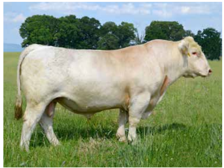
FTJ MONTICELLO 1806 SIRE OF LOT 67

Selling pregnant Recipient with sexed mating of WCF Mr Silver Gun 467 x Fink Perfection 3834 7738 FL. Lot 65 donor cow with a mating to the very popular Silver Gun. Some of the best EPDs you can find in the breed with this mating! Also notice the Cigar influence from great donor M6 Ms E46's Duke 248 PET, used in Double-H and now Southern Cattle Co's ET programs. This masterful planned mating will enable someone to compete with anyone!