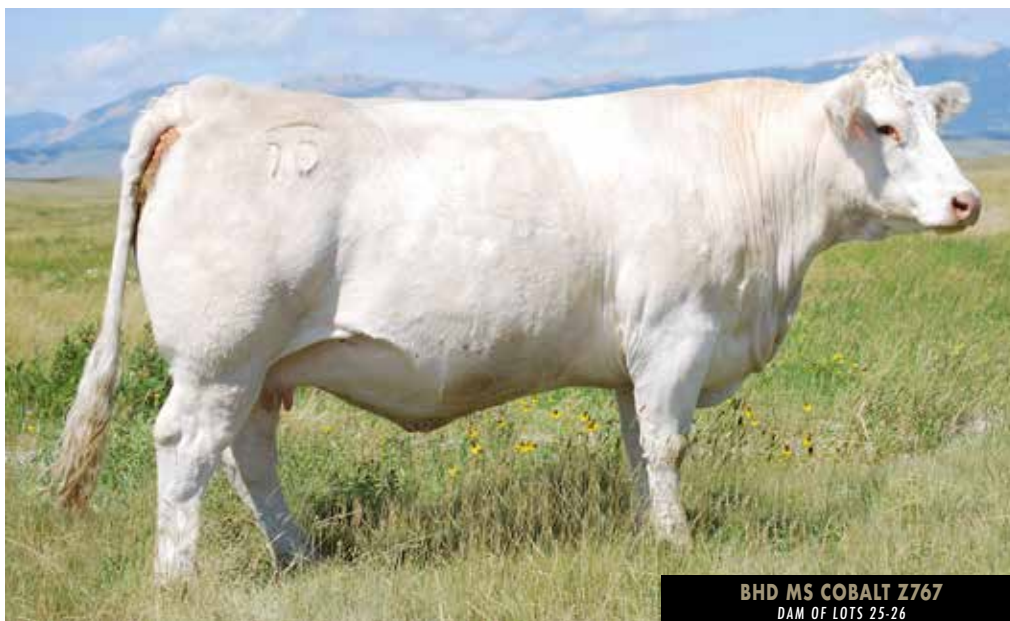
BHD MS COBALT Z767 DAM OF LOTS 25-26

SELLING OPEN ET HEIFER WITH SEMEN FURNISHED ON ANY EVANS SIRE