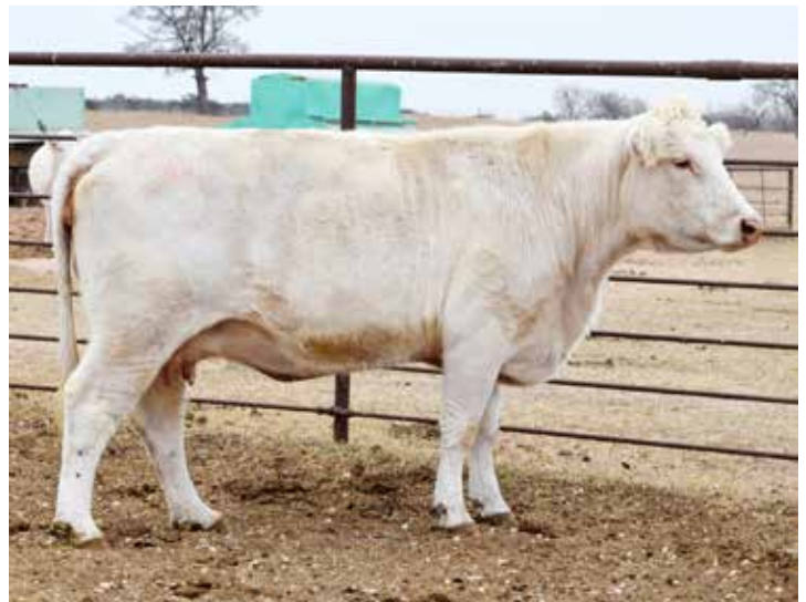
RE MS DUKE DYNASTY 960