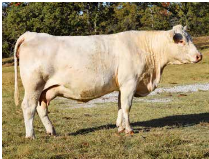
FINK PERFECTION 9315 3833 GS LOT 23 DONOR DAM

Selling 3-IVF embryos from mating of LT Blue Value 7903 ET x RE Cigar Girl 116 Embryos will be the same mating as the lot 21 heifer so you can evaluate the good value this is for your program. 116 is a super milking, easy-fleshing donor with plenty of size, capacity, and volume blended with a superb disposition. Her embryos have been good to "take" and those that do ET work, know what that means. You can elevate your program with this kind of mating to produce top of the line females!