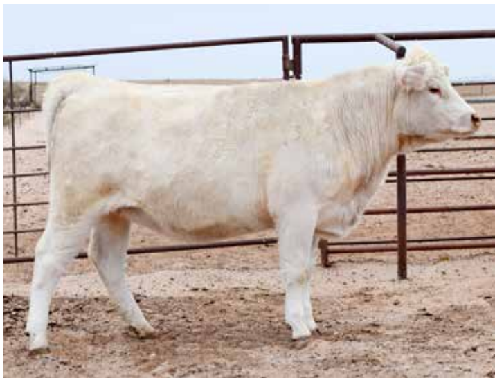
BARA MS B2011 TANK 12K ET P