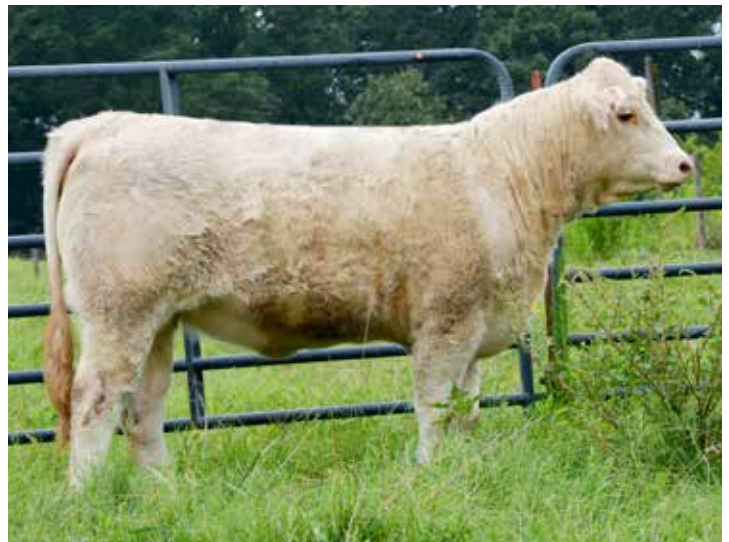
WC THIN LIZZIE 291

Bred A-I on 1/28/24 to Tri-N Bob Dylan 201K, one of the hottest Red Charolais in the breed. Lizzie's dam, Throttle Body 104, is one of the most prolific cows in the breed! Starting as a 2-year old in 2013, she's calved, 11/13; 12/14; 10/15; 10/16; 8/17; 11/18; 10/19; 9/20; 10/21; 9/22, and her 2023 calf hasn't been registered. You want fertility in your herd, acquire this excellent example!