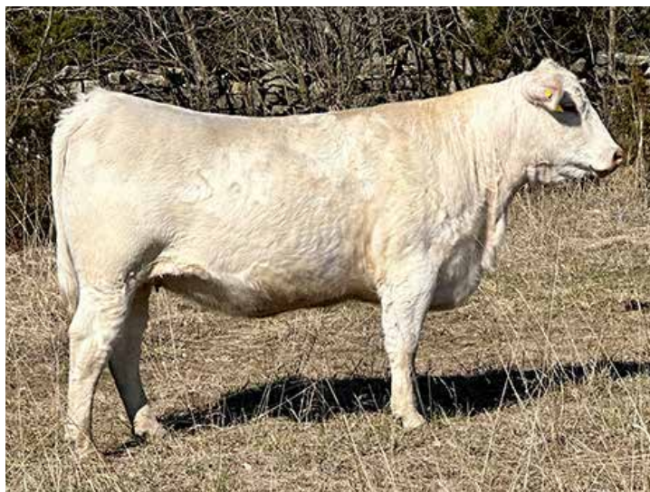
FINK MISS 243 7982 NS LOT 79 DONOR DAM