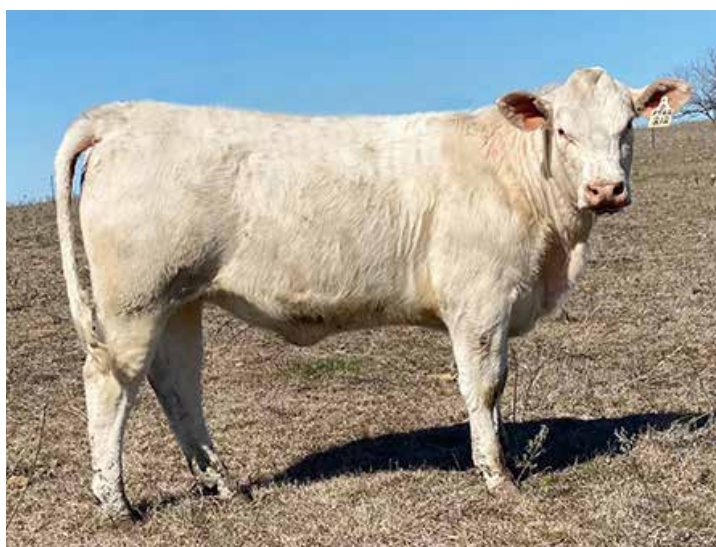
MC MS TRUE DESTINY 212