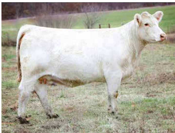
LCC NANCY 3342 ET